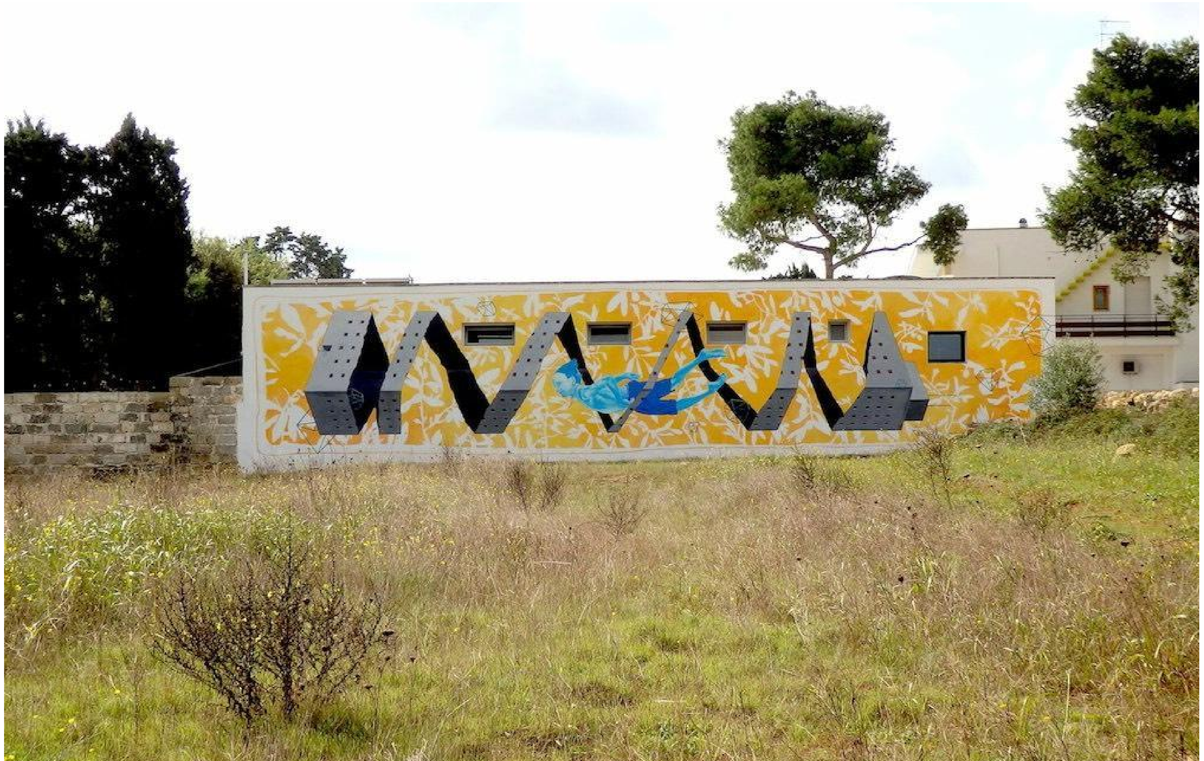
Client: Wonderlust Rome Year: 2016 Budget: $5,000 Dimension: 72 x 18 ft Location: Lecce, Italy Material: Acrylic paint on wall Mural title: Floating