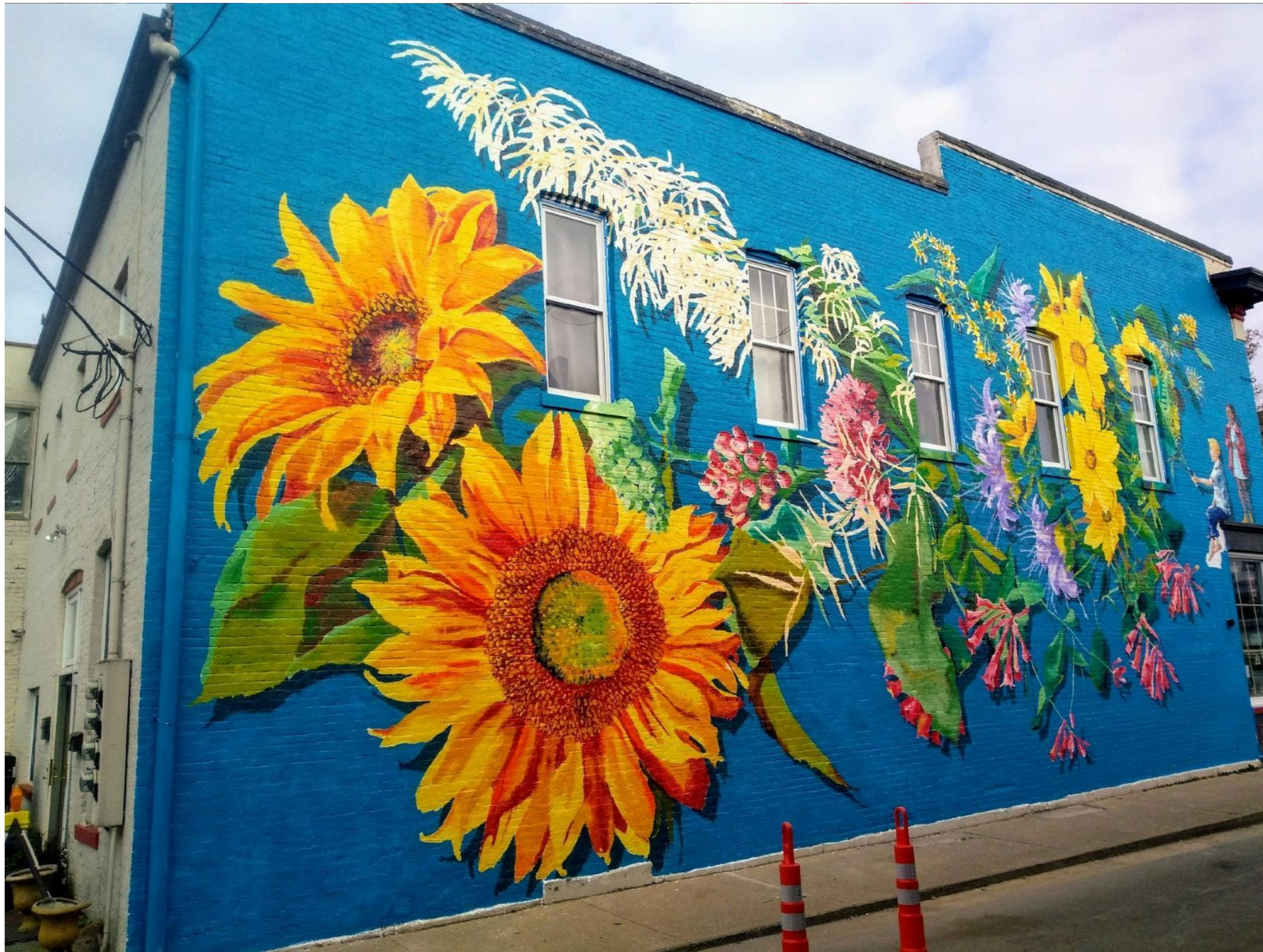
Client: FrankArt Year: 2019 Budget: $19,000 Dimension: 80x31 ft(25x10 meters) Location: Frankfort, KY Material: Acrylic paint on brick wall Mural title: Surprise! Description: A mural about Kentucky native flowers and plant, and to promote friendship between children.