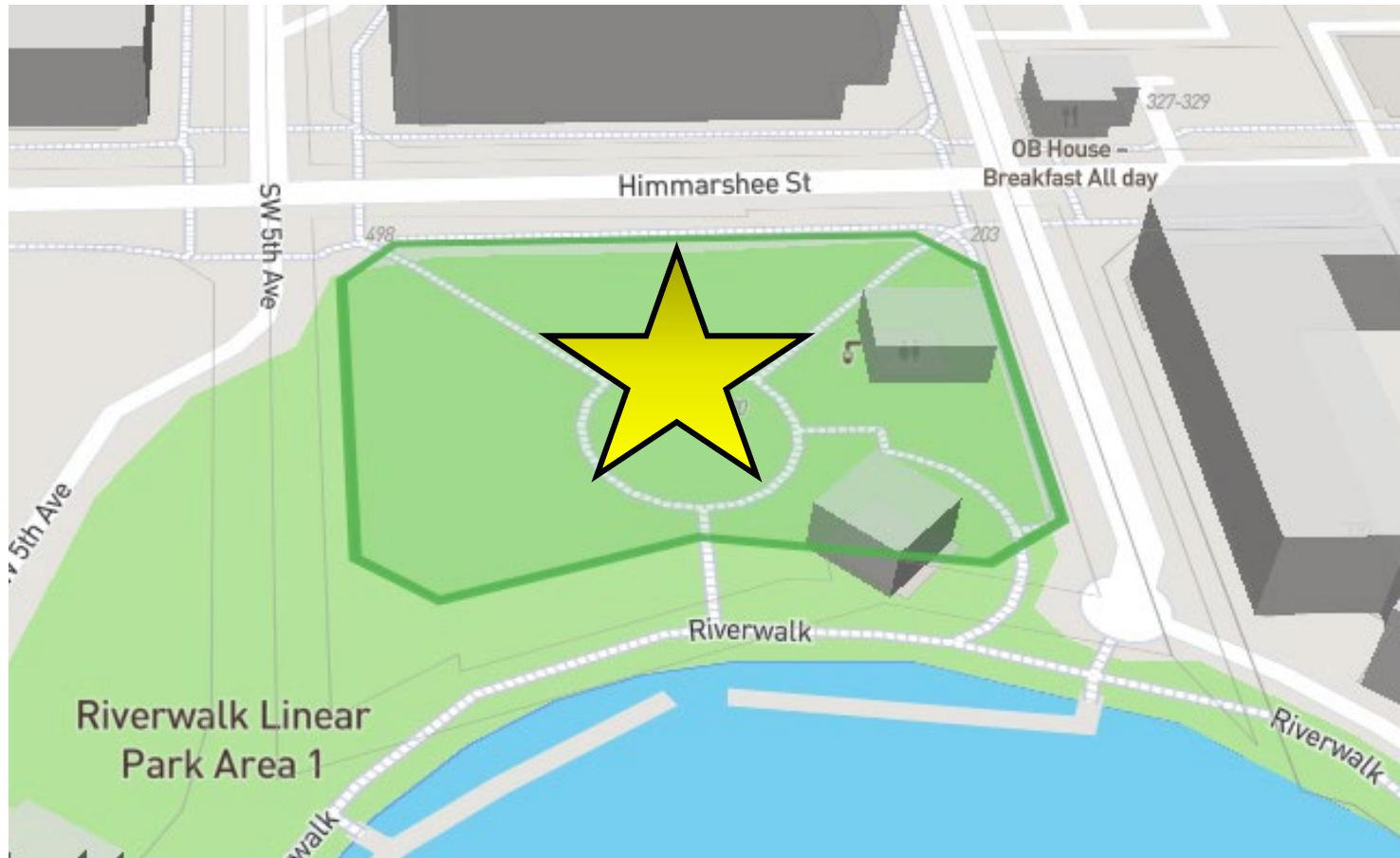
EXHIBIT C I Love Cabo Verde