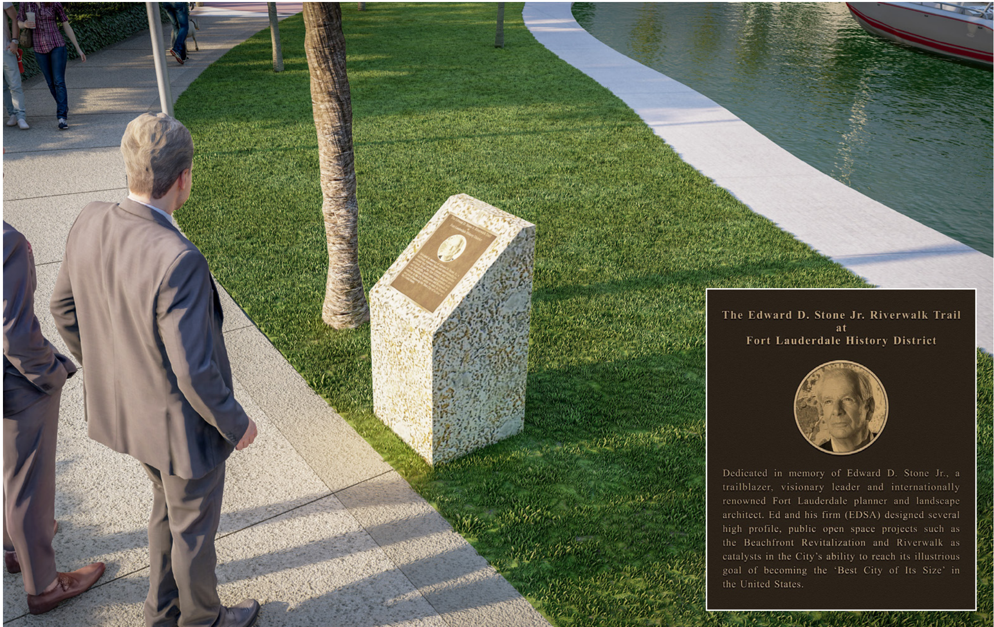
The Edward D. Stone Jr. Riverwalk Trail at Fort Lauderdale History District