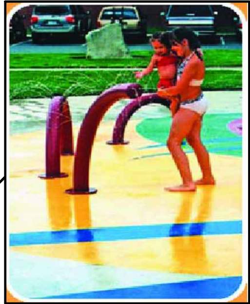
Splash Pad Features