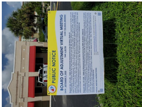
SIGNS FACING N OCEAN BLVD