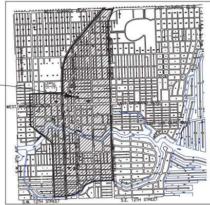
EXHIBIT "A" LEGAL DESCRIPTION OF DOWNTOWN CHARACTER AREA THAT IS DIVIDED INTO THREE AREAS: NEAR DOWNTOWN, URBAN NEIGHBORHOOD AND DOWNTOWN CORE, TOGETHER WITH A DOWNTOWN CHARACTER AREA SKETCH.

LANDS LYING IN SECTIONS 2, 3, 10 AND 11, TOWNSHIP 50 SOUTH, RANGE 42 EAST, BROWARD COUNTY, FLORIDA; BEING MORE PARTICULARLY DESCRIBED AS FOLLOWS: