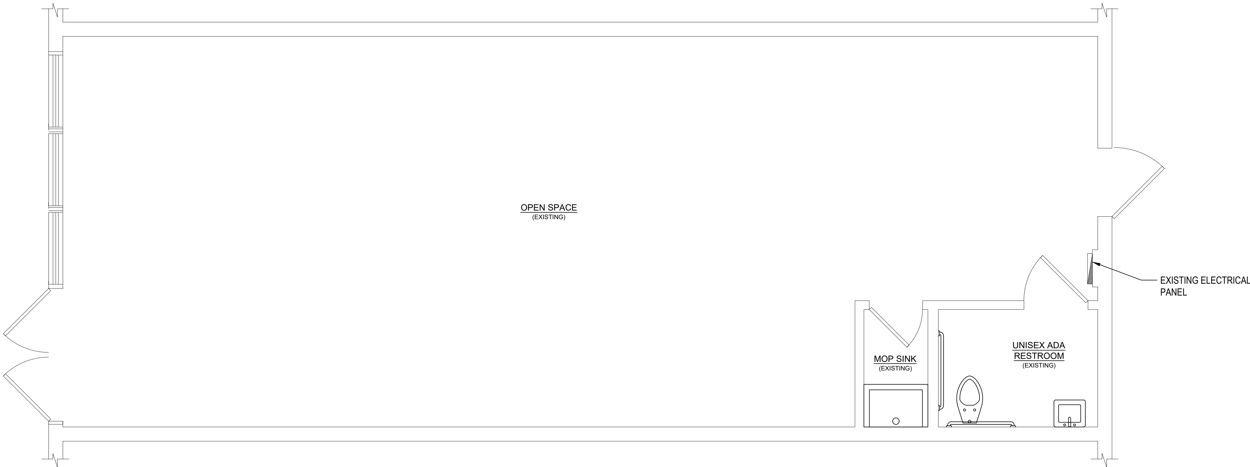
PROPOSED FLOOR PLAN SCALE: 3/8"=1'-0"