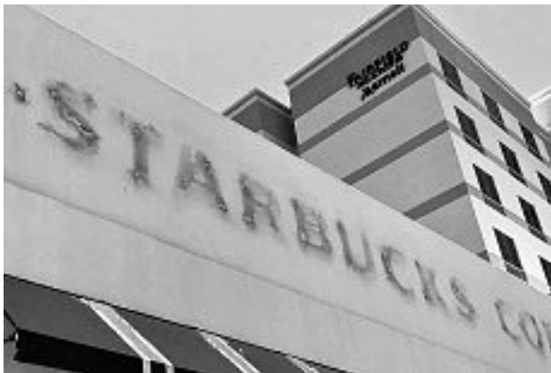
The Starbucks at the corner of Broward Boulevard and Federal Highway in downtown Fort Lauderdale is closed.

He is unsure what he'll do with the corner — there is a "For lease" sign in front of the old Scotty's building