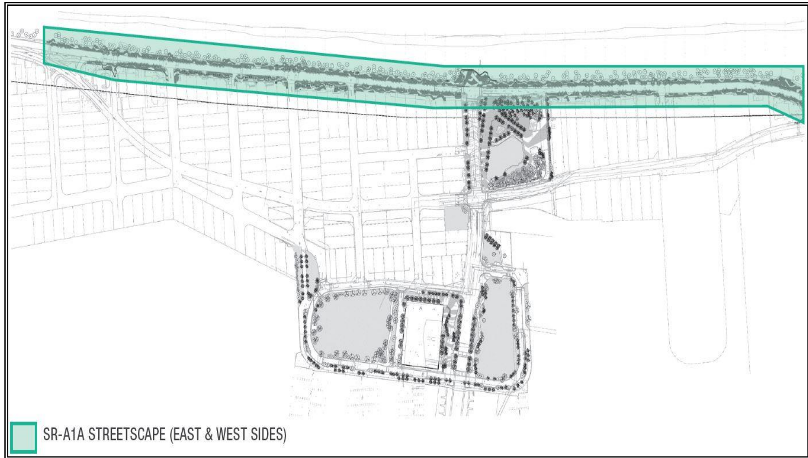
Figure 3a: SR A1A Streetscape Improvement Project