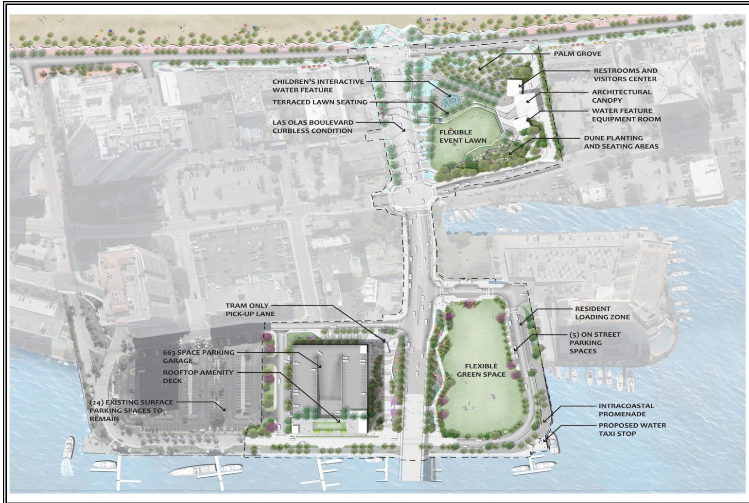
Figure 2: Las Olas Boulevard Corridor Improvement Project