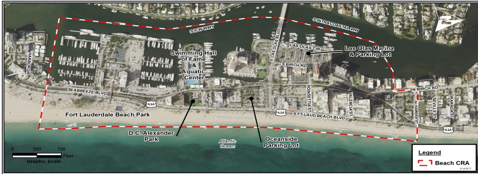
Figure 1: Community Redevelopment Area Boundaries and Legal Description

That area lying east of the eastern channel line of the Intracoastal Waterway; west of the mean high water line of the Atlantic Ocean; south of the northern right-of-way line of Alhambra Street east of the center line of the right-of-way of Birch Road, extended eastward to intersect the mean high water line of the Atlantic Ocean and then south along the center line of the right-of-way of Birch Road to the intersection of the northern right-of-way of Sebastian Street west of the center line of Birch Road and then extended westward to intersect the eastern channel line of the Intracoastal Waterway; and north of the southern property line of Bahia Mar extended eastward to intersect the mean high water line of the Atlantic Ocean and extended westward to intersect the eastern channel line of the Intracoastal Waterway.