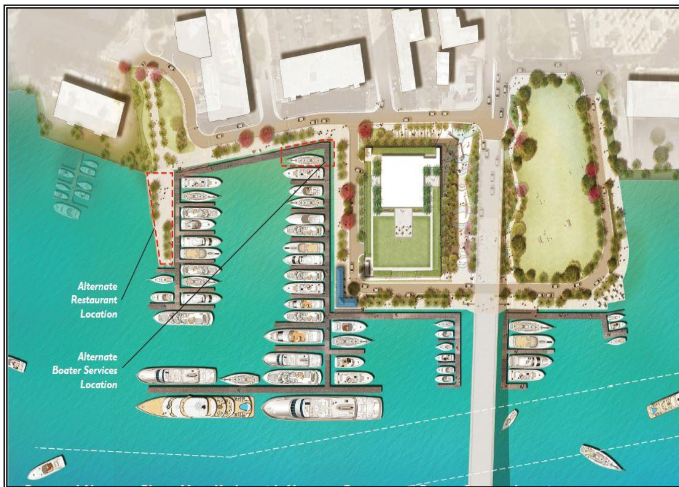
Figure 5: Expansion of the Las Olas Marina