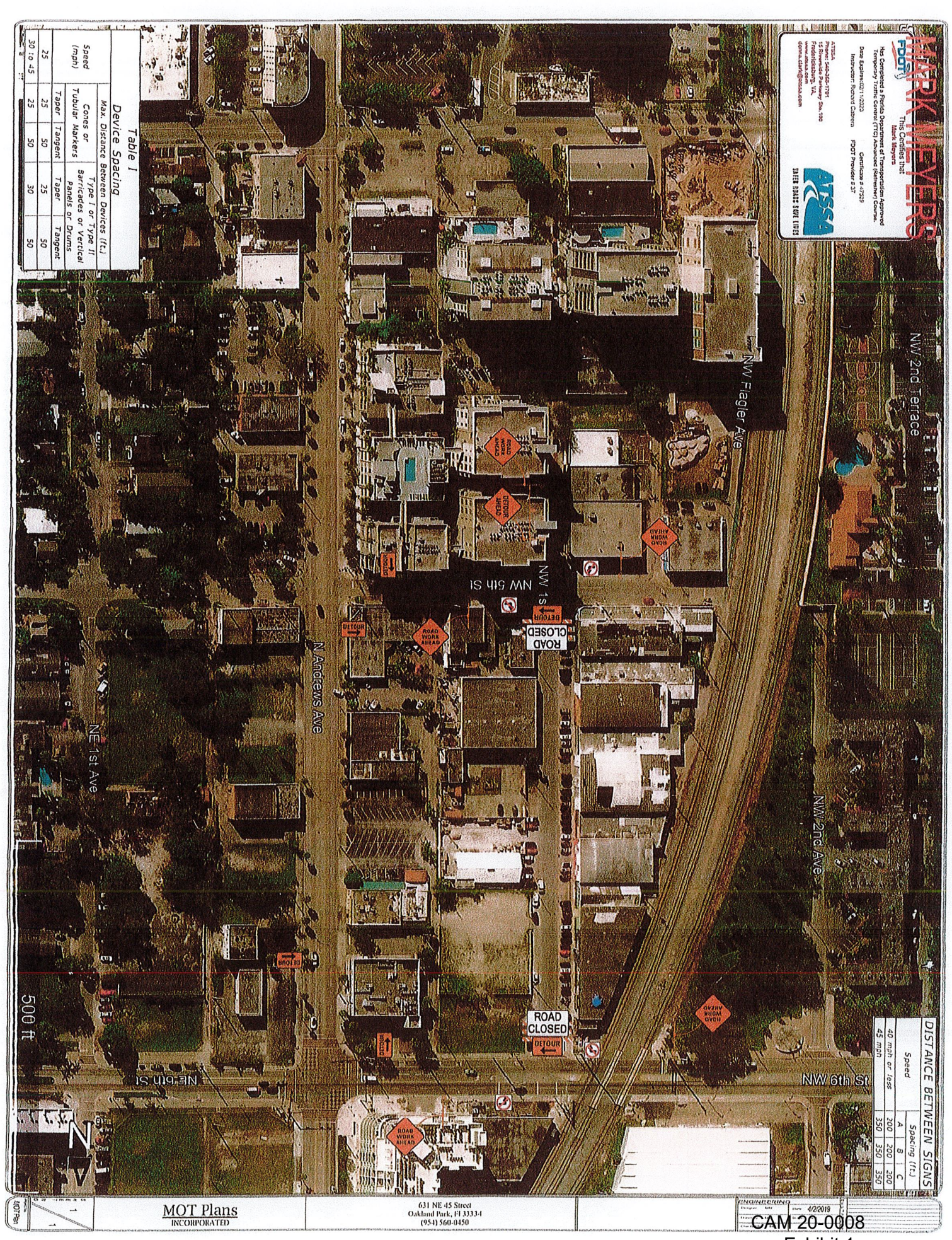
Exhibit 1a Page 4 of 4