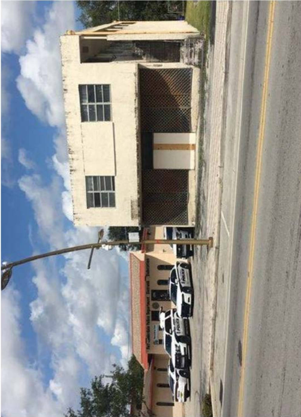
1227 Sistrunk Boulevard – Existing Conditions