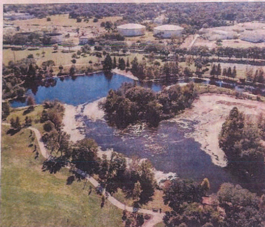
The lake at St. Petersburg's Walter Fuller Park was contaminated by up to 1.7 million gallons of wastewater from a 50-day spill at the Northwest Water Reclamation Facility, top. City officials put up signs around the lake warning of contamination.