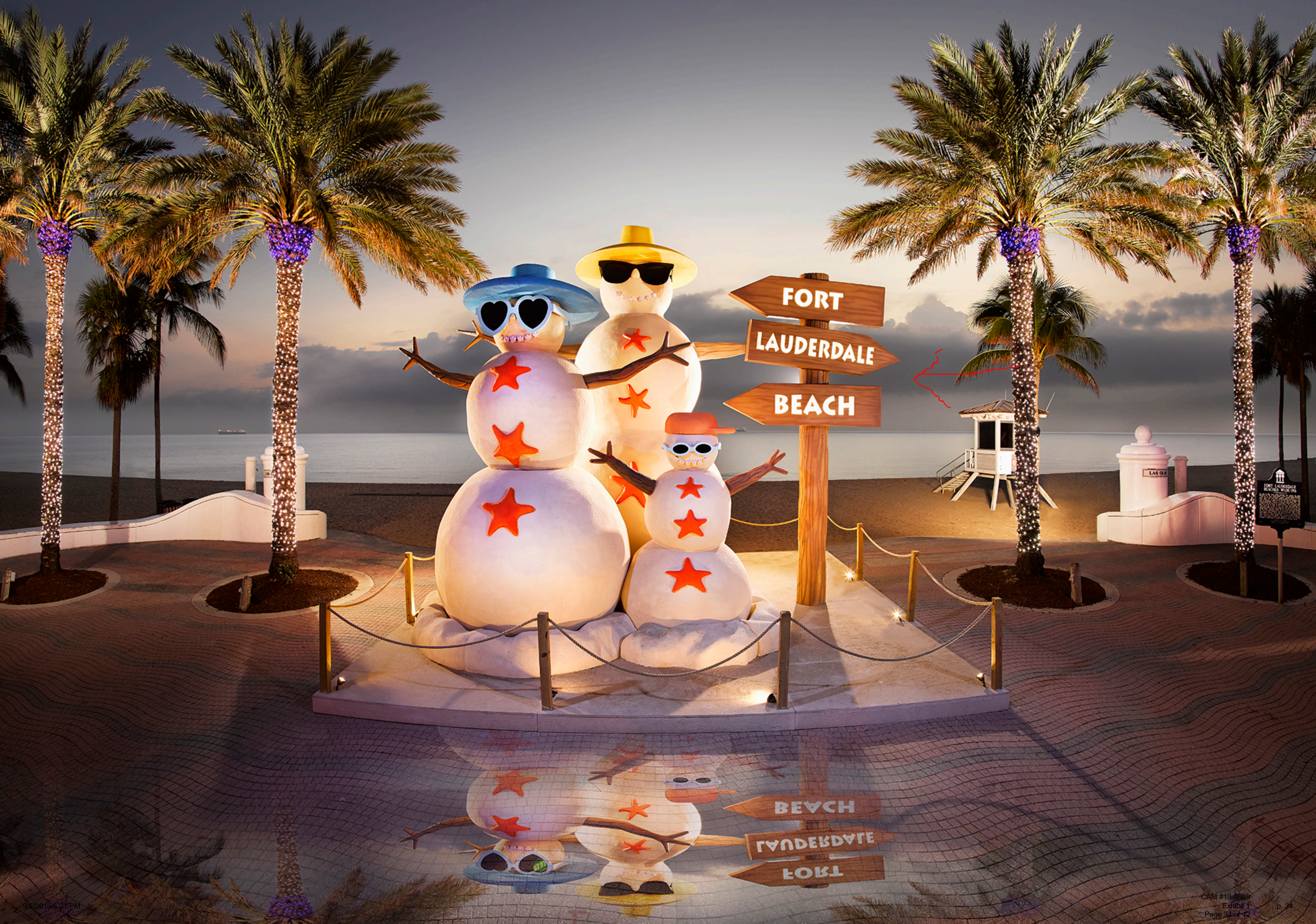
EXHIBIT D - EXAMPLE OF RECESSED LIGHTED FORT LAUDERDALE