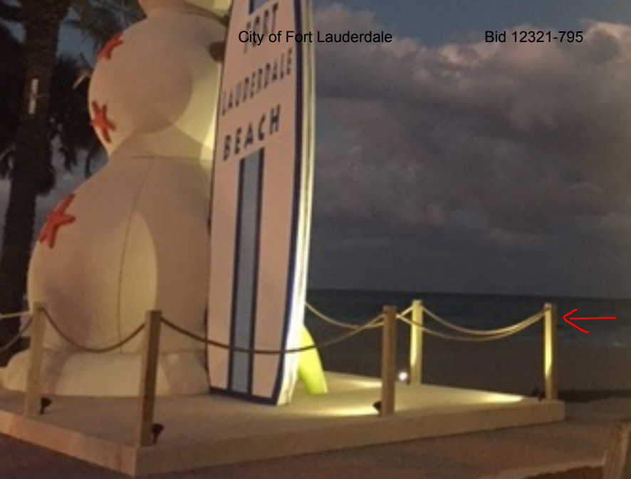
EXHIBIT C - EXAMPLE DISPLAY PLATFORM WITH ROPE BARRIER