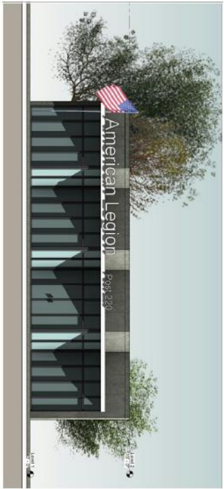
2 SCALE: 1/8" = 1'-0" PROPOSED FRONT ELEVATION