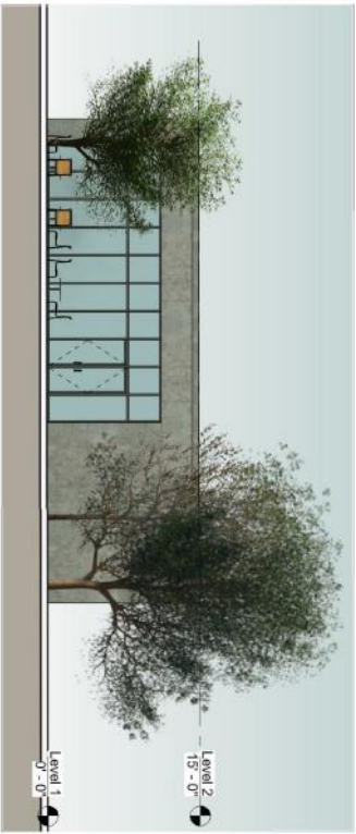
1 SCALE: 1/8" = 1'-0" PROPOSED REAR ELEVATION