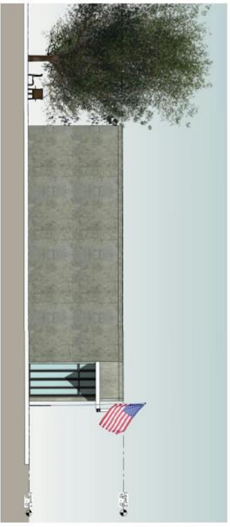
3 SCALE: 1/8" = 1'-0" PROPOSED SIDE ELEVATION