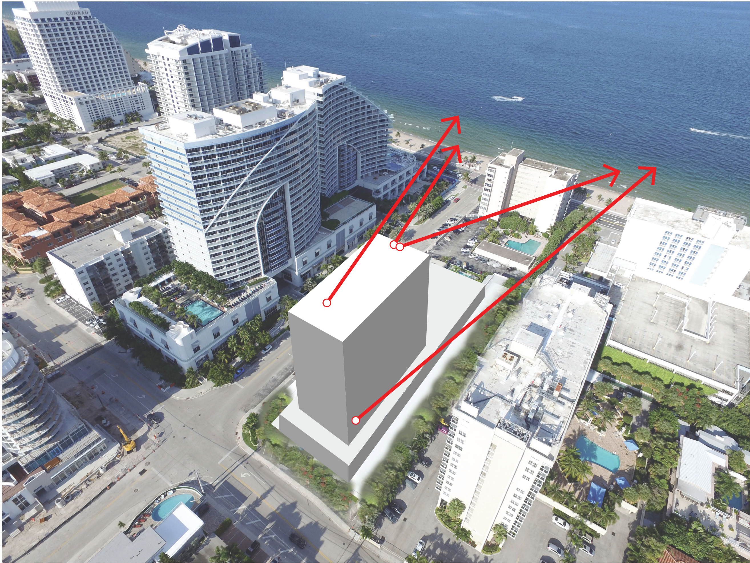
UNOBSTRUCTED OCEAN VIEWS FROM PROPOSED HOTEL