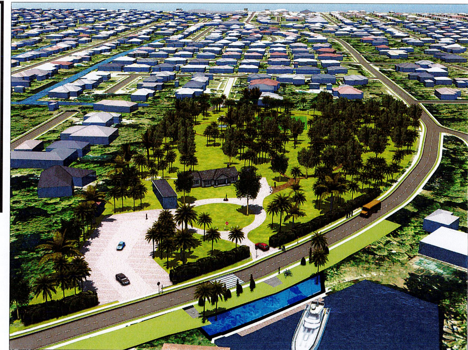
Black Property Concept FRONT PERSPECTIVE VIEW