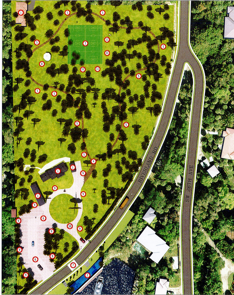
Black Property Concept PLAN VIEW