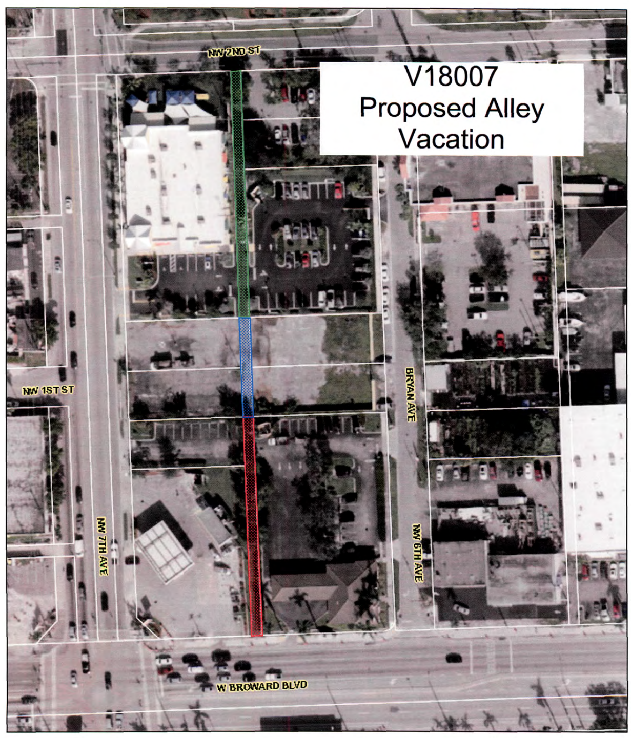
August 20, 2018