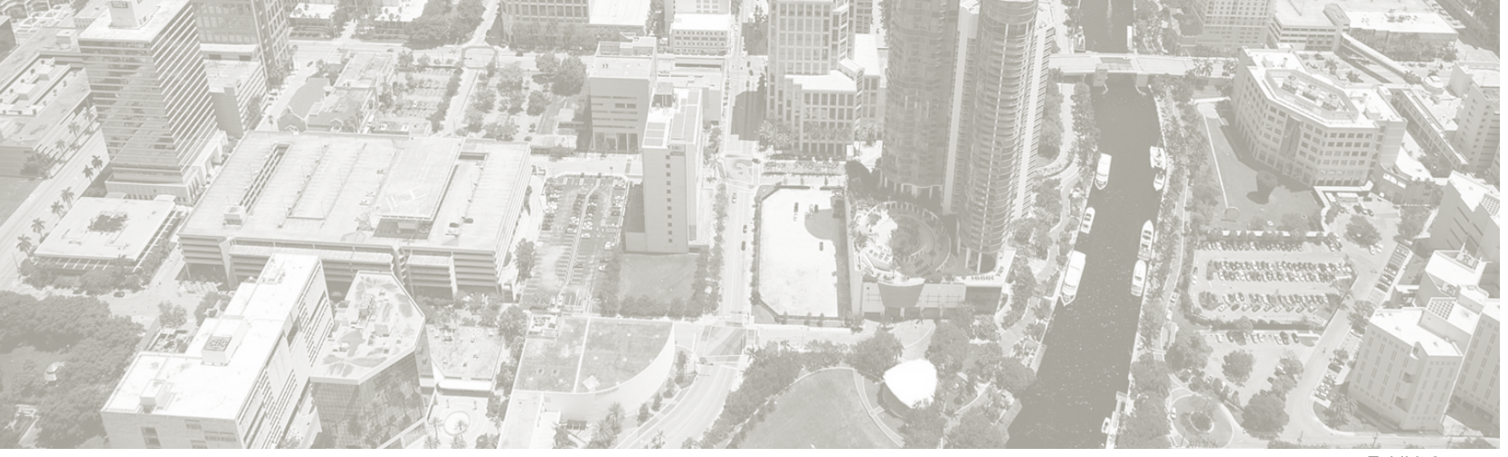
Exhibit 3 CAM #18-1127 Page 6 of 7

Does the City Commission Wish to Maintain Current Regulations Permitting Temporary Signs within the Right-of-Way?