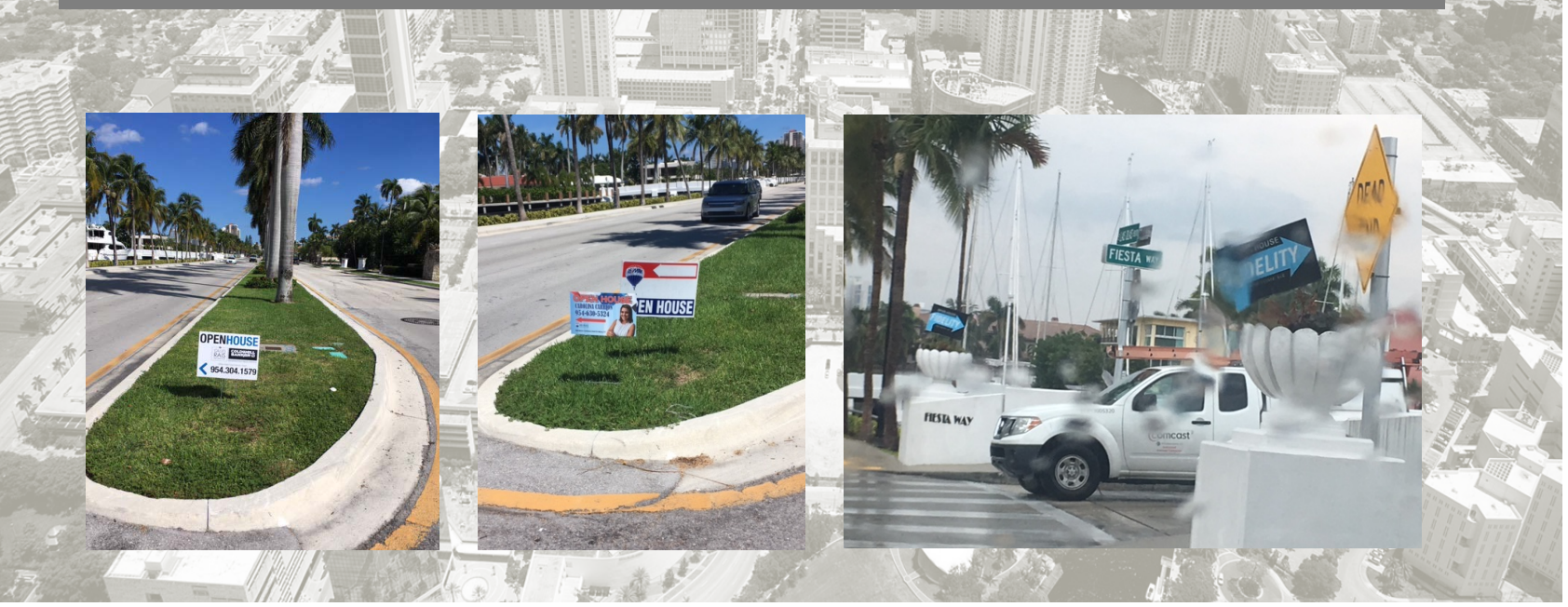
Exhibit 3 CAM #18-1127 Page 5 of 7