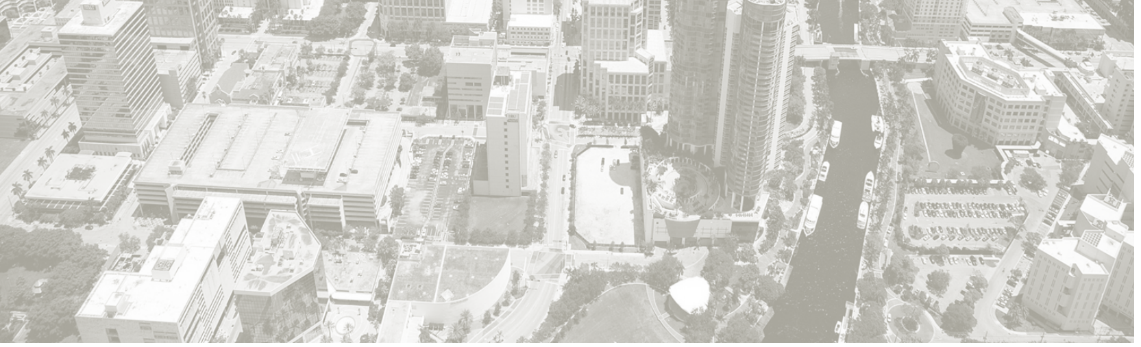
Exhibit 3 CAM #18-1127 Page 2 of 7

Does the City Commission Wish to Maintain Current Regulations Permitting Temporary Signs within the Right-of-Way?