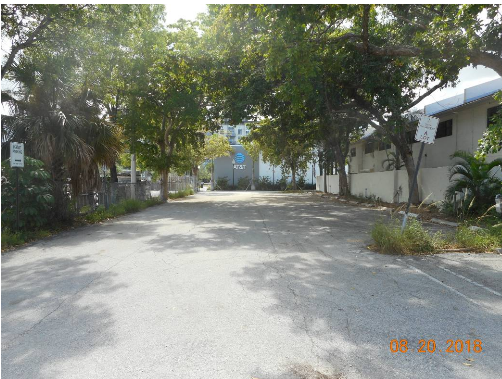
Site from 7 th Street