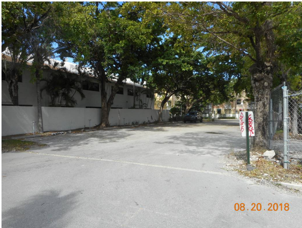
Site from the Alley