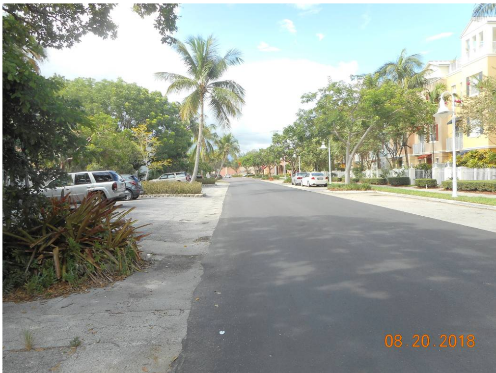
Street view to the North