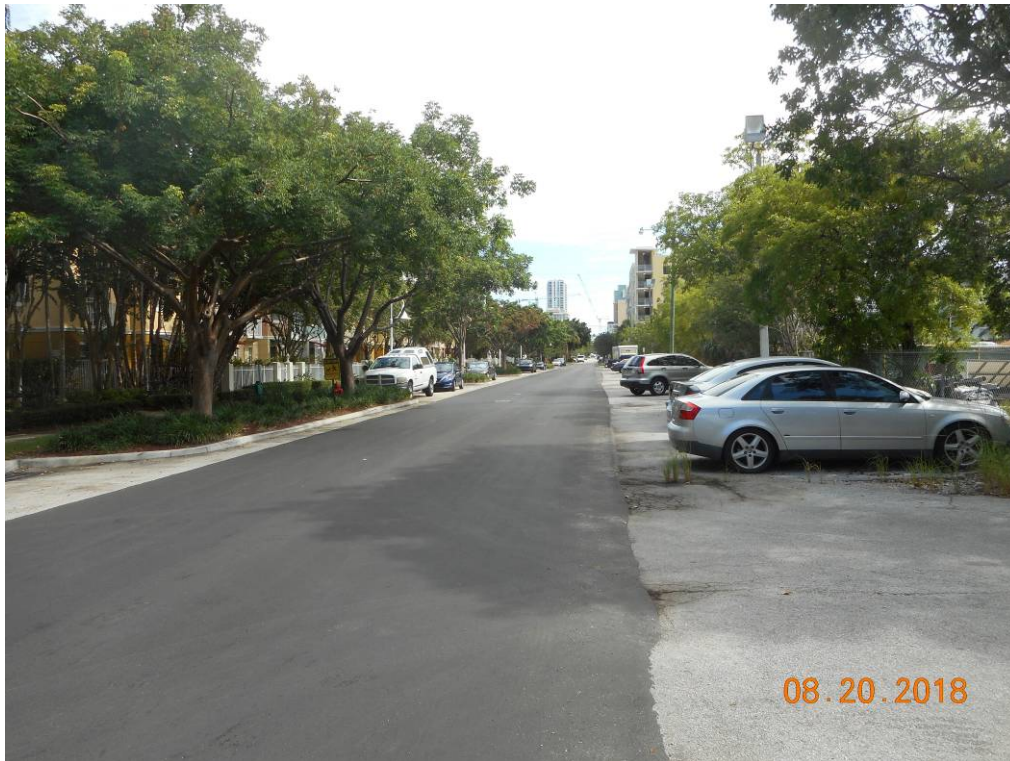
Street view to the South