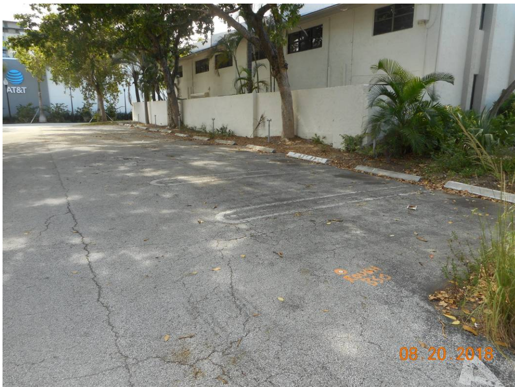
Marked Parking Spaces