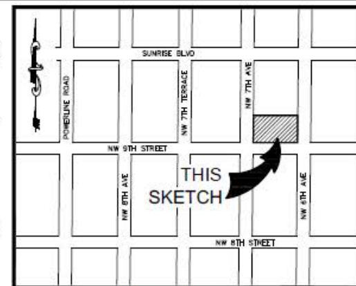
LOCATION MAP: NOT TO SCALE

SAID LANDS LYING IN THE CITY OF FORT LAUDERDALE, BROWARD COUNTY, FLORIDA AND CONTAINING 40,800 SQUARE FEET (0.937 ACRES), MORE OR LESS.