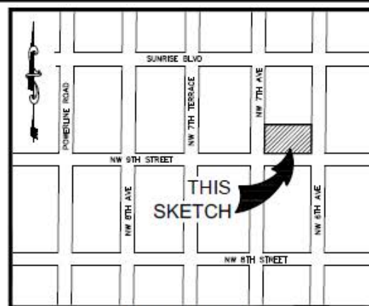
LOCATION MAP: NOT TO SCALE

SAID LANDS LYING IN THE CITY OF FORT LAUDERDALE, BROWARD COUNTY, FLORIDA AND CONTAINING 40,800 SQUARE FEET (0.937 ACRES), MORE OR LESS.