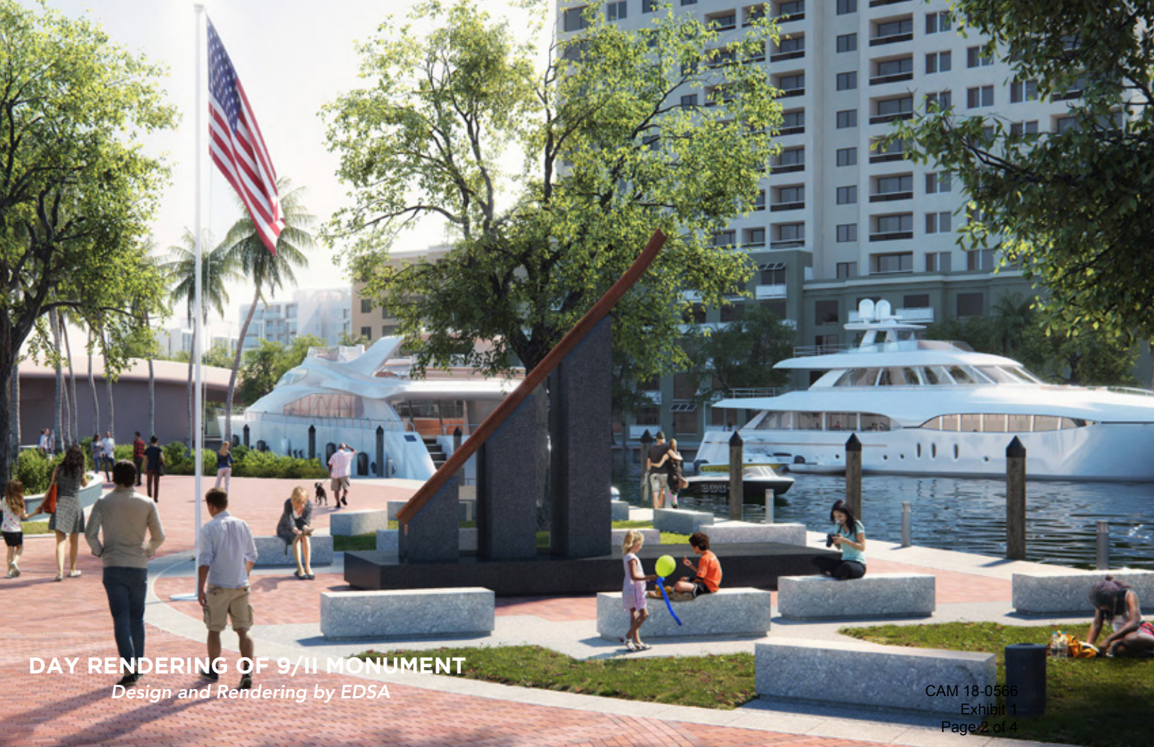
DAY RENDERING OF 9/11 MONUMENT Design and Rendering by EDSA