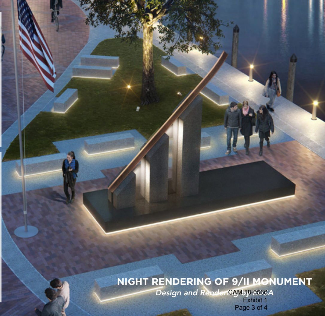
NIGHT RENDERING OF 9/11 MONUMENT

The monument displays a path rail segment from the tracks from the World Trade Center wreckage, in an uplifted position held by granite support pillars, which refer to the solid bedrock of Manhattan that supports its massive buildings. The granite support pillars are in pairs, joined by an internally illuminated acrylic spine that suggests the hope of light emerging out of darkness. The base of the monument will carry the story line of the monument and light will be included to be sure the monument is respectfully lit at night. The artifact location is central to Riverwalk and provides visibility from all vantage points.