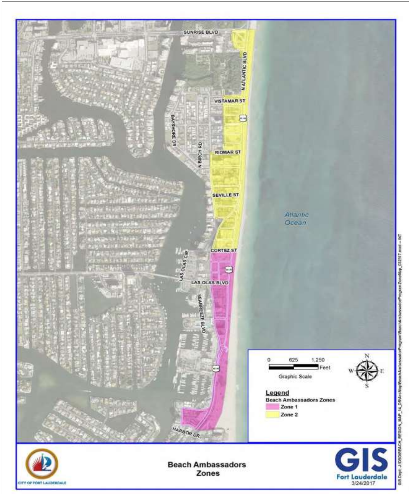
EXHIBIT A: Central Beach Map