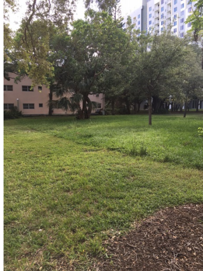
View looking south (#16 - #18)