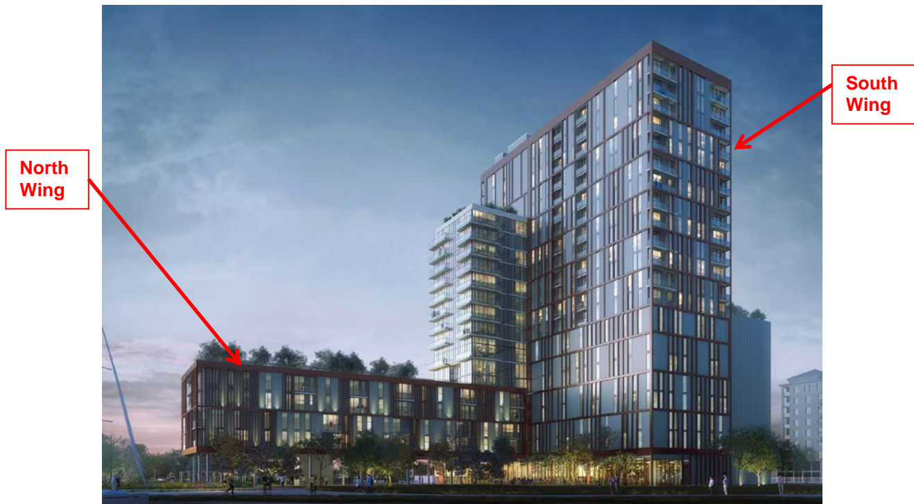
Rendering of Alexis-Tarpon River looking southeast

Due to the setback and low height of the massing set closest to the river, it does not appear that the Stranahan House will be adversely impacted by this undertaking. Smoker Park, which is directly abutting the new construction site, interacts more with the project and requires additional evaluation.