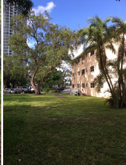
View looking north (#20 - #25)

As part of a review for new construction that may have the potential to cause adverse effect on a historic resource, criteria as outlined within the Code of Federal Regulations is utilized to evaluate the undertaking: