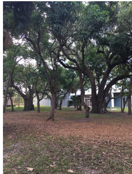
View from within Smoker Park

Positive aspects of the project include the raising of the first two floors of the North Wing of the new construction project, creating open space that leads directly into the park. Along the South Wing elevation, clear glass windows open onto the park space which creates interaction between the structure and the park. Additionally, as noted on Sheet L-2, the applicant is proposing the