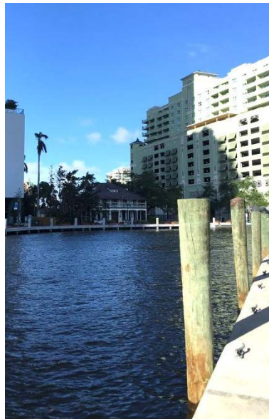
View of Stranahan House from Project Site

Due to the setback and low height of the massing set closest to the river, it does not appear that the Stranahan House will be adversely impacted by this undertaking. Smoker Park, which is directly abutting the new construction site, interacts more with the project and requires additional evaluation.