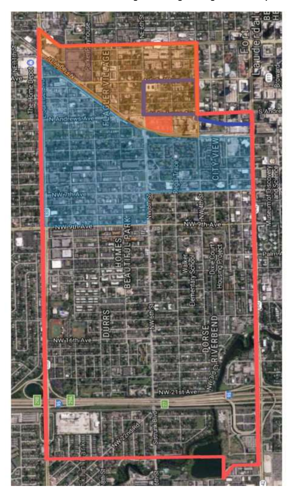
EXHIBIT B: Northwest Progresso Flagler Heights CRA Map