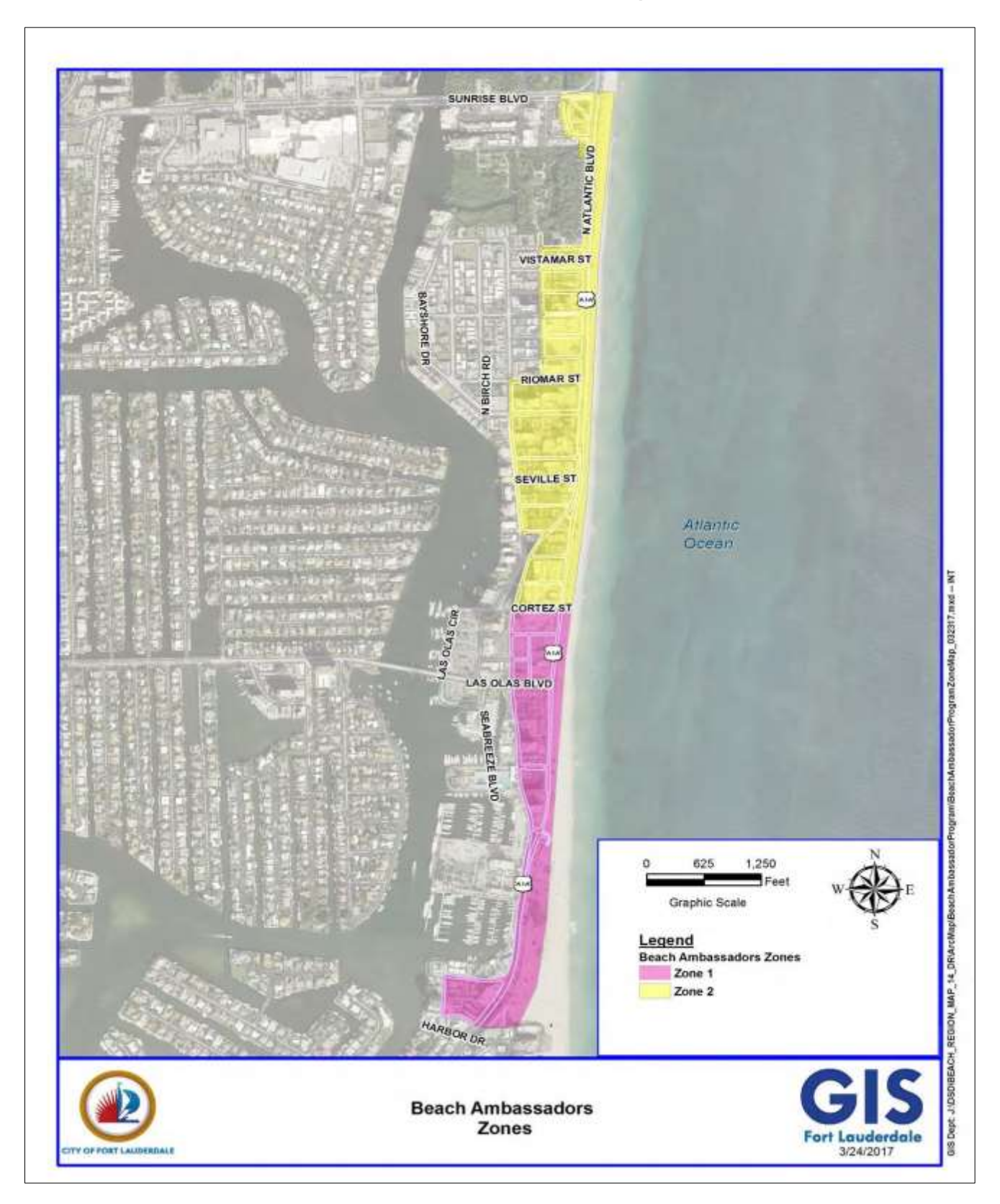
EXHIBIT A: Central Beach Map