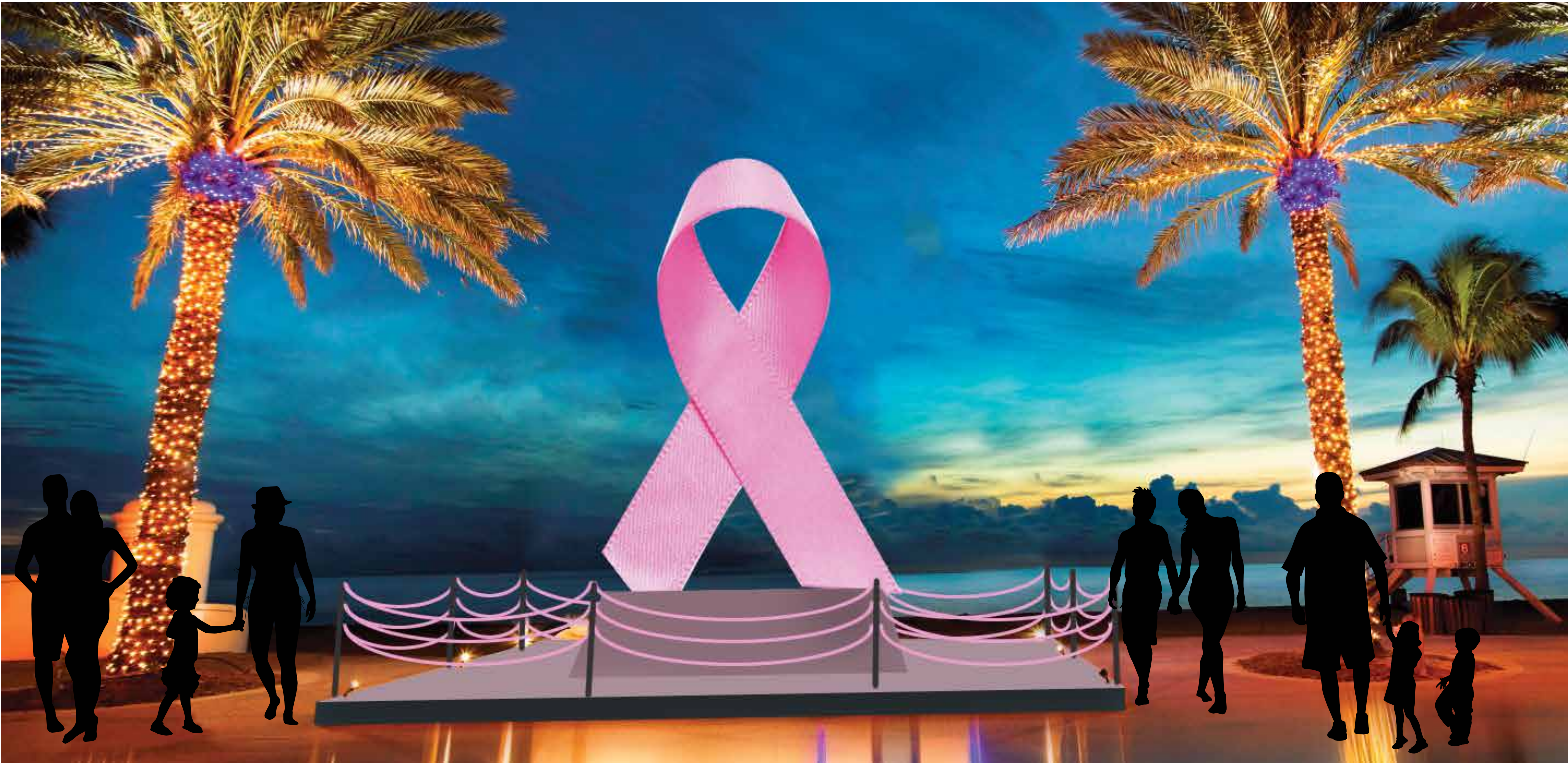
1 CONCEPT FRONT ELEVATION SCALE: N.T.S.