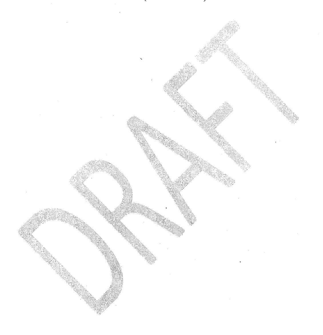
Exhibit "A" Legal Description of the Existing Marina Premises (See Attached)