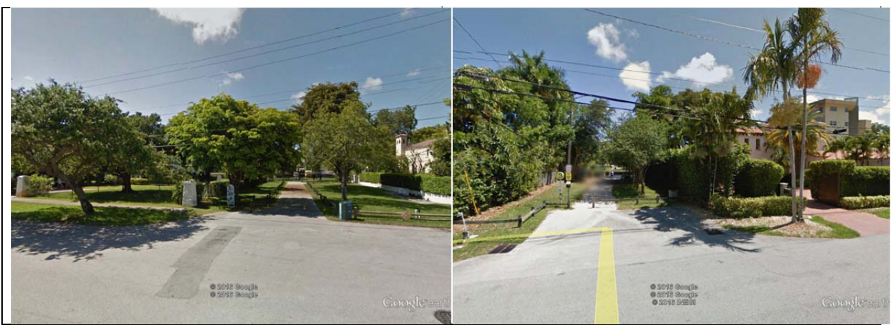
Fig. 3. S.E. 9<sup>th</sup> Avenue street end, Rio Vista neighborhood.