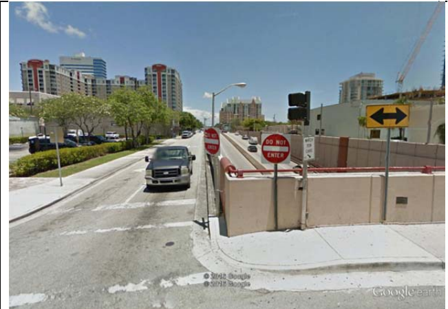
Fig. 1-Tunnel slip road, U.S. 1, looking north

<u>Description of the Project:</u> The applicant has brought a project to the Board to build a pedestrian plaza on top of the NR<sup>1</sup> eligible Henry F. Kinney tunnel. The project would involve structural changes to the tunnel. Presently, according to the applicant's report, an auto driver's sight, approaching the intersection at Las Olas Boulevard, is blocked by the height of the tunnel wall from seeing an approaching pedestrian trying to cross at the slip road.