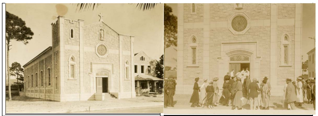
Figures 1 & 2 Saint Anthony Church & rectory on Las Olas Blvd. ca. 1921; congregation arriving for Mass.