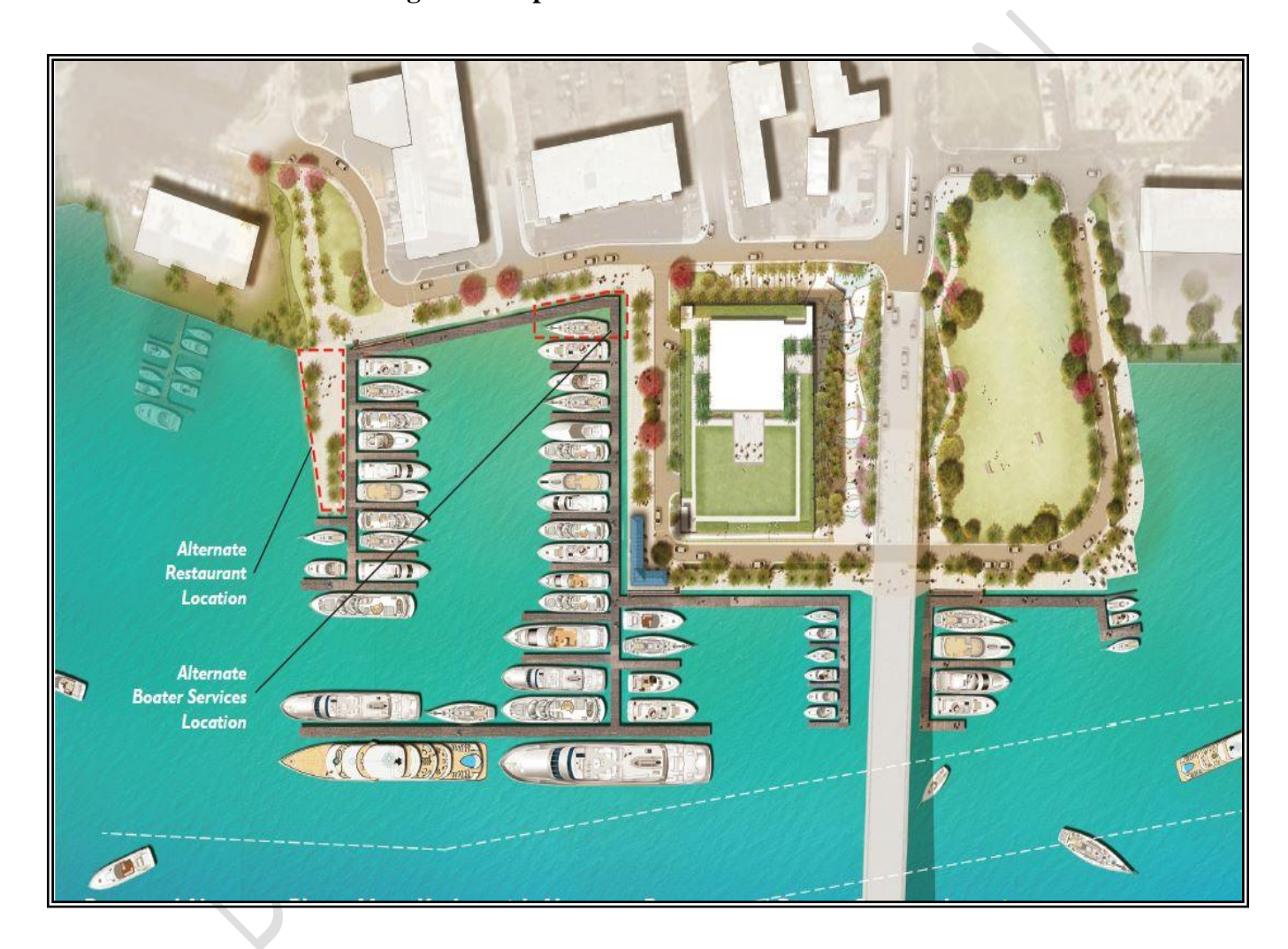
Figure 5: Expansion of the Las Olas Marina