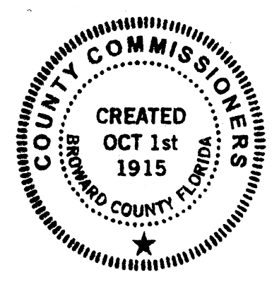
Broward County Administrator, as Ex-officio Clerk of the Broward County Board of County Commissioners

BROWARD COUNTY, by and through its Board of County Commissioners