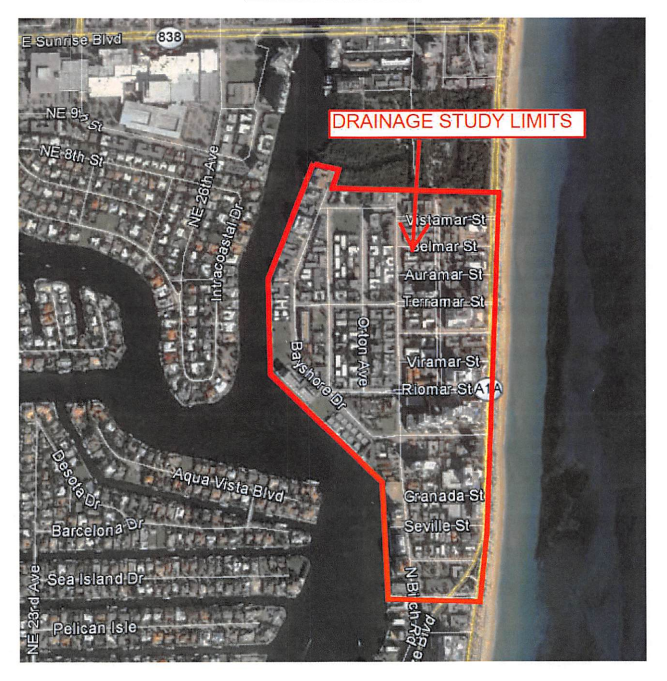
Exhibit 1 Location Map