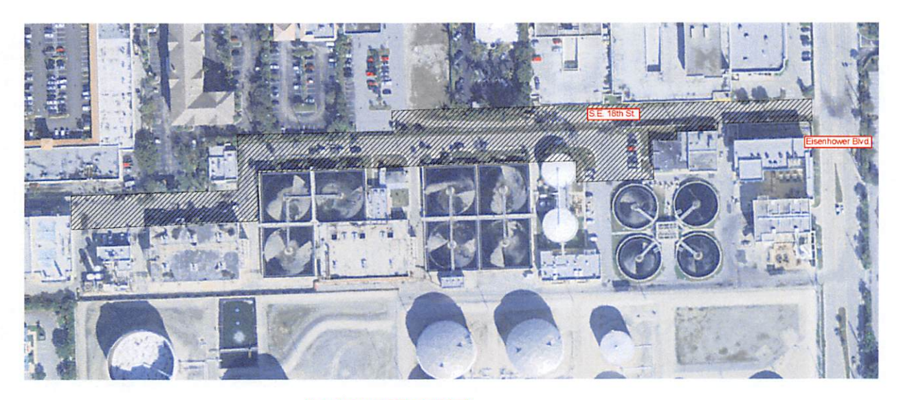
George T. Lohmeyer WWTP Work Limits