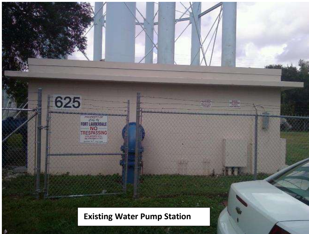
Existing Water Pump Station