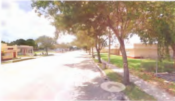
NE 4 th Avenue in the City of Fort Lauderdale

over 170 traffic crashes have occurred since 2013. Wilton Manors has seen 2 fatalities and over 100 crashes in the same time. Strava, an application in which users track walk/bike trip data, shows NE 4 th Avenue as a preferred bike corridor linking Wilton Manors and downtown Fort Lauderdale.