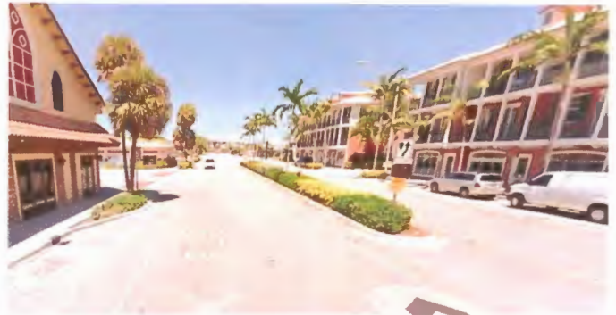
Wilton Drive in City of Wilton Manors