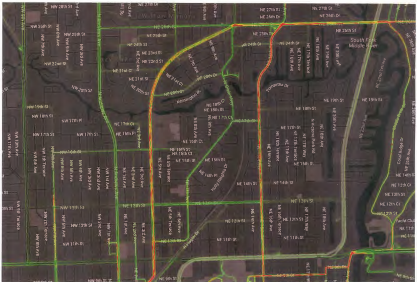
Strava.com Global Heat Map of Fort Lauderdale- Bike trips from January 2014 through May 2015.