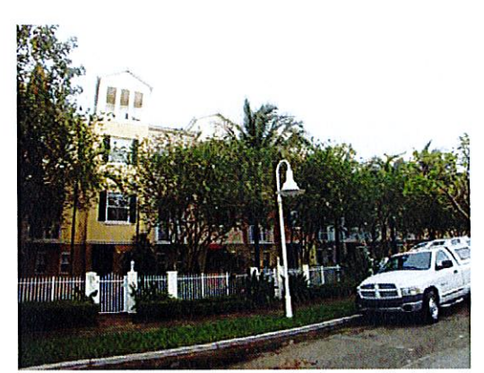
Townhouses Across St From Subject