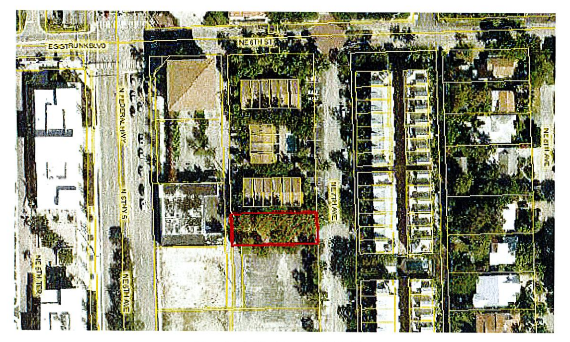
Subject Plat In Red Outline