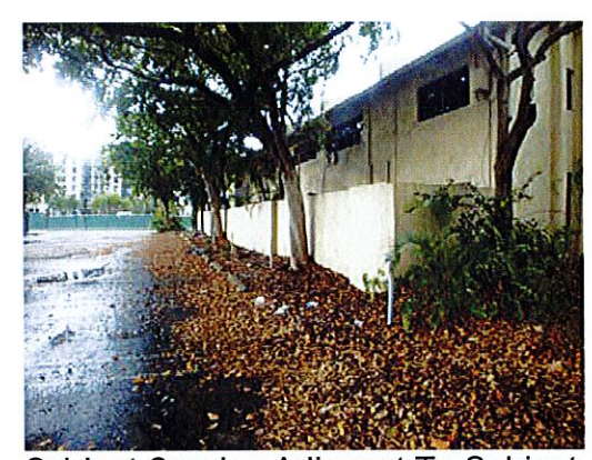
Subject Condos Adjacent To Subject