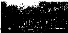
Stranahan House Fort Lauderdale, Florida