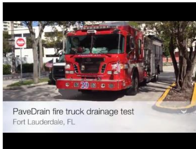
PaveDrain fire truck drainage test Fort Lauderdale, FL

This is a pilot project of the City's Transportation and Mobility Department, and is the first application of its kind in South Florida. Installed at City Hall's Orchid Parking Lot, which is also a demonstration area for other sustainable technologies, the Pave Drain System is designed to mitigate the danger and effects of major stormwater flow over paved surfaces. It looks like any other tiled surface, but functions dramatically differently.