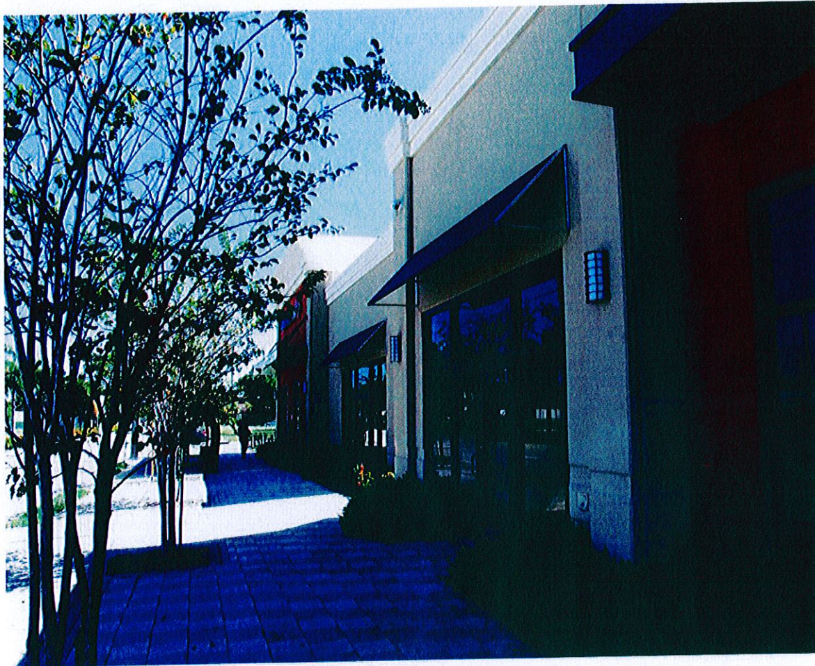
Shoppes on Arts Avenue Fronting Sistrunk Boulevard – Proposed Location for Brooklyn Italian Ice Company