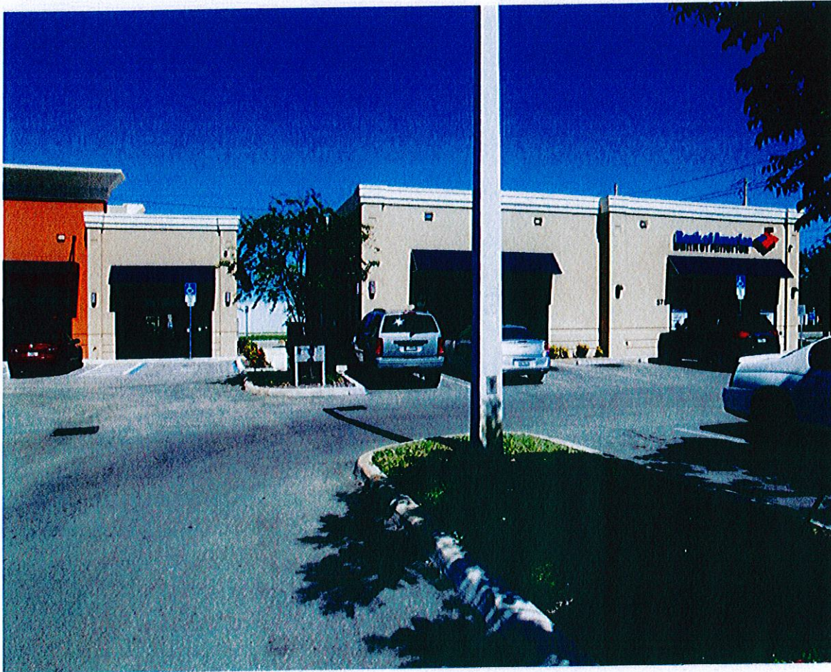
Shoppes on Arts Avenue - View from Parking Lot Looking North

Proposed Location for Brooklyn Italian Ice Company