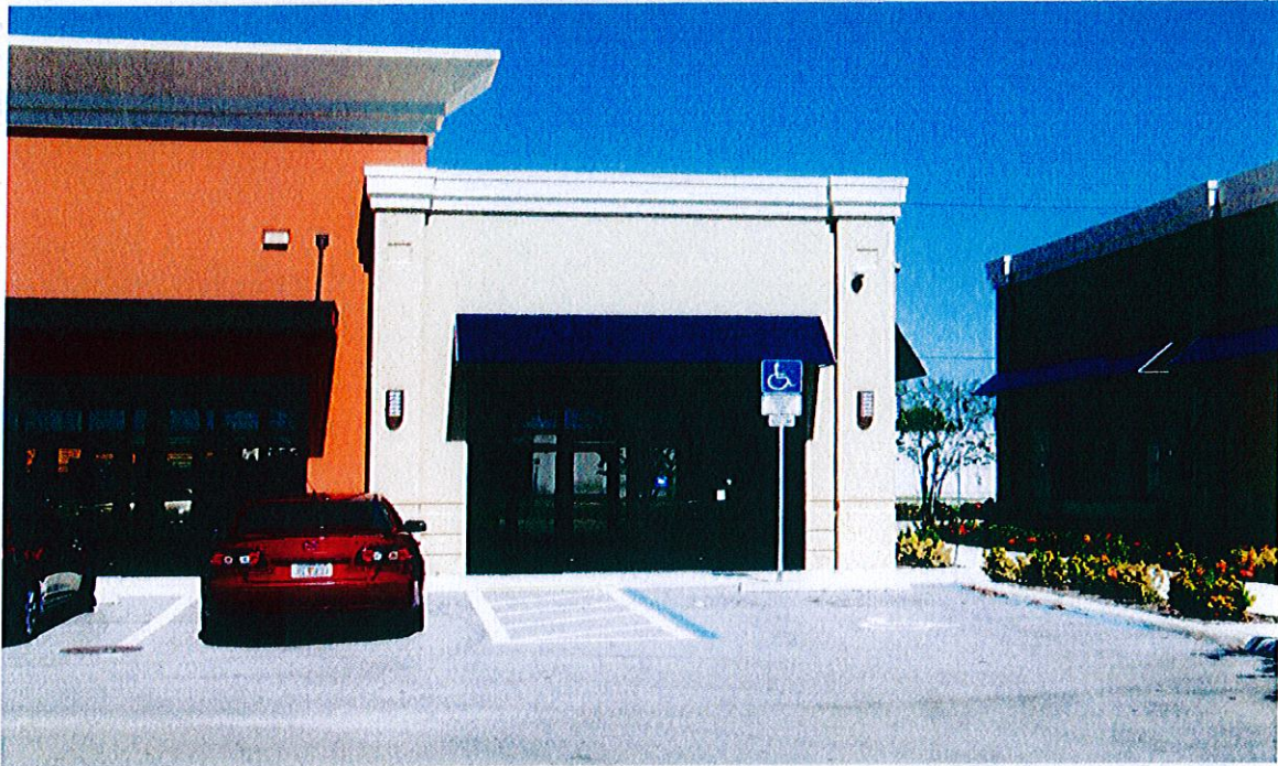
Shoppes on Arts Avenue – Proposed Location for Brooklyn Italian Ice Company