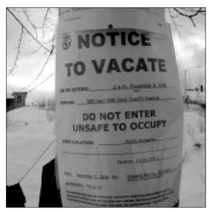
Example of signage posted in a former encampment.

Anchorage Responsible Beverage Retailers Association (ARBRA)