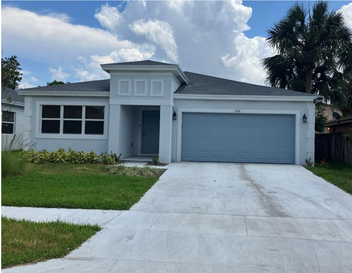
1216 NW 2 Street