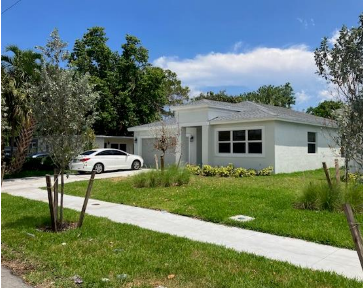
1214 NW 2 Street