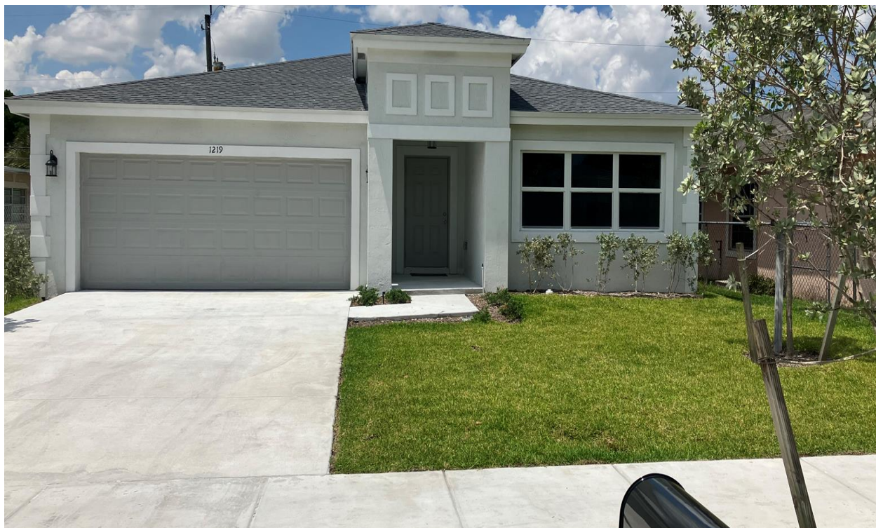
1219 NW 2 Street