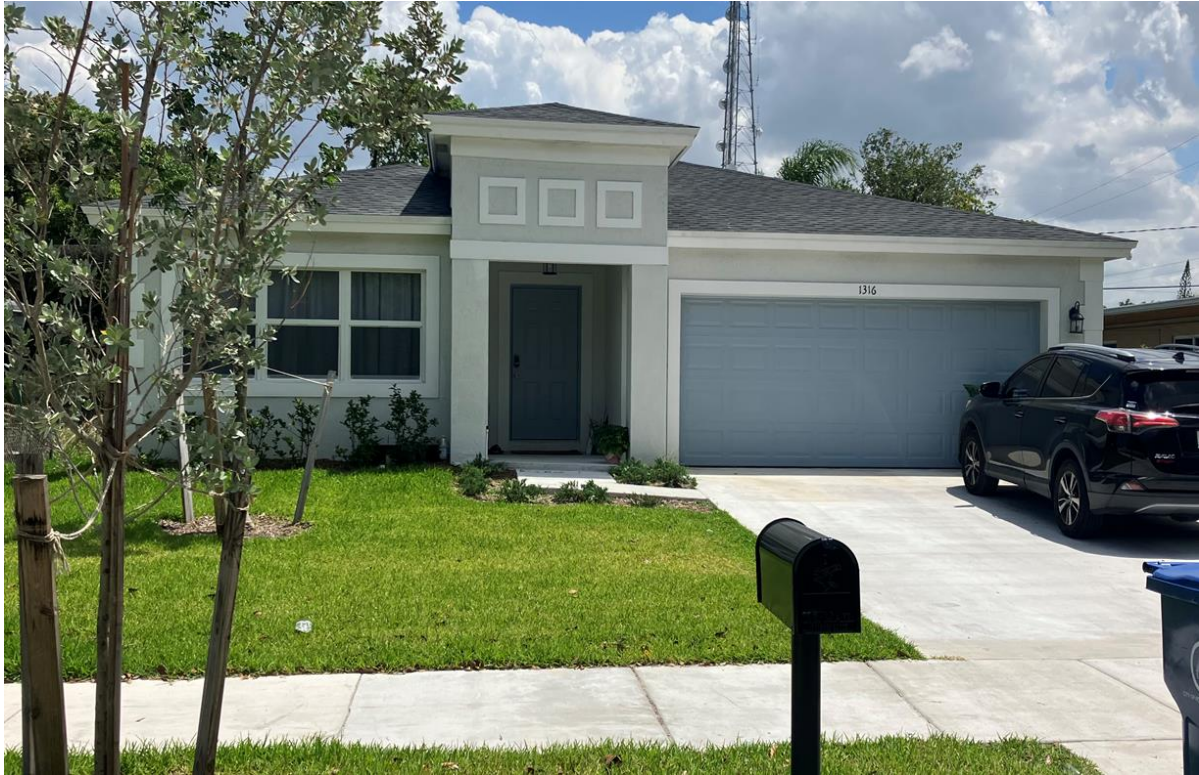
1316 NW 2 Street