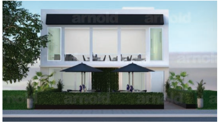
Rendering of Food and Friends Southern Comfort Kitchen and Bar located at 1310-1312 Sistrunk Boulevard