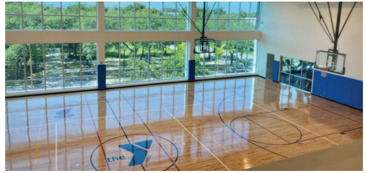
L.A. Lee YMCA/Mizell Community Center YMCA Gym

feet and is home to YMCA traditional programming, Broward College, and ground floor retail. Additionally, various amenities are available for public use including gymnasium/basketball court, outdoor swimming pool, preschool, Black Box Theatre, multi-purpose space, and business incubator.