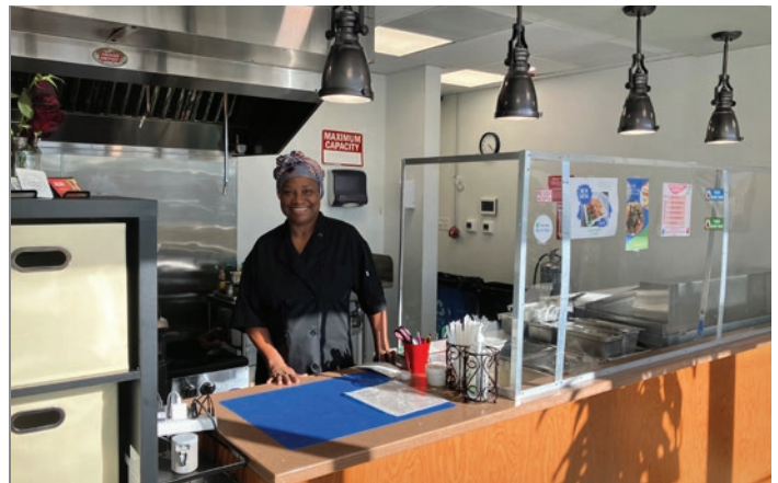
Photo of Blue Tree Café Restaurant

square foot base rent in consideration of CRA assistance in funding and tenant match at the property.