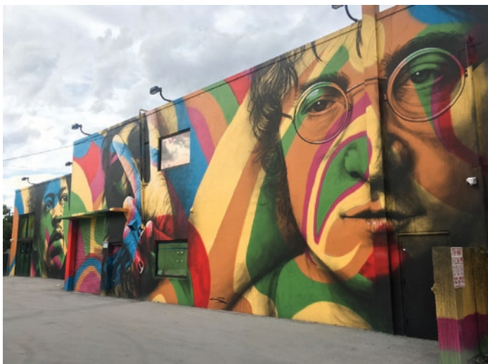
Mural Art on NE 4th Avenue in the Central City CRA