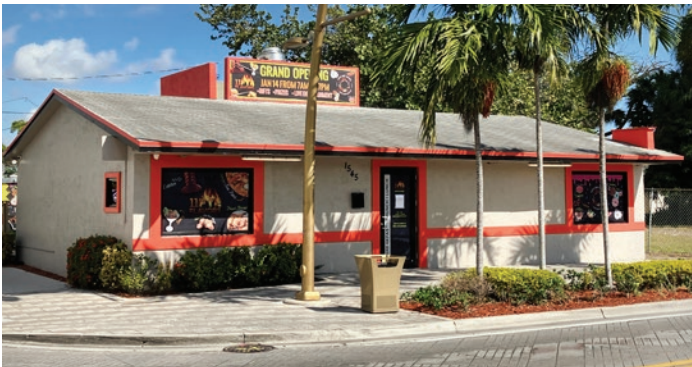
Completion of 11 Fye Flavors X Tasty Mini Donuts