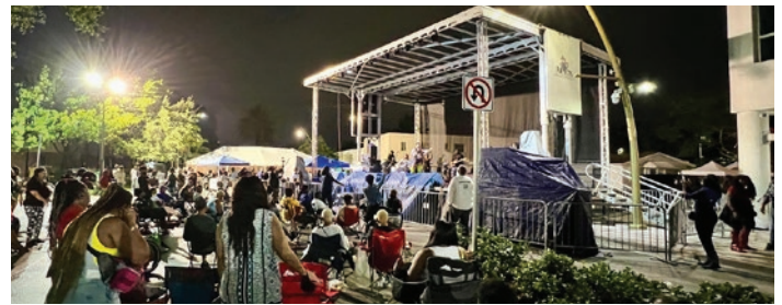
Finally Friday on Sistrunk