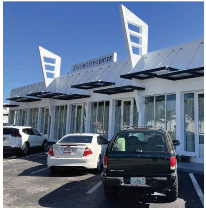
850 NE 13 Street - After Renovations