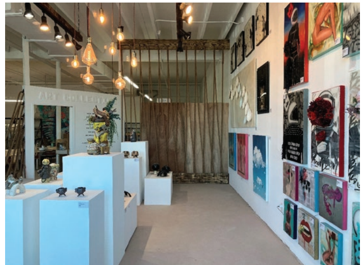
Mingo Pottery Studio at 800 NE 13 Street