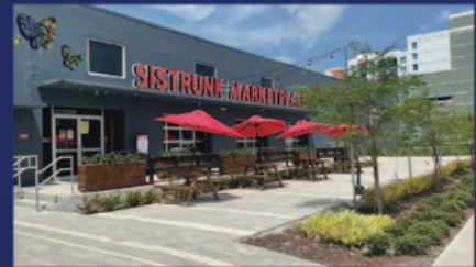
Sistrunk Marketplace and Brewery Award for Outstanding Rehabilitation, Renovation or Reuse Project

Fort Lauderdale Community Redevelopment Agency Sistrunk Marketplace and Brewery