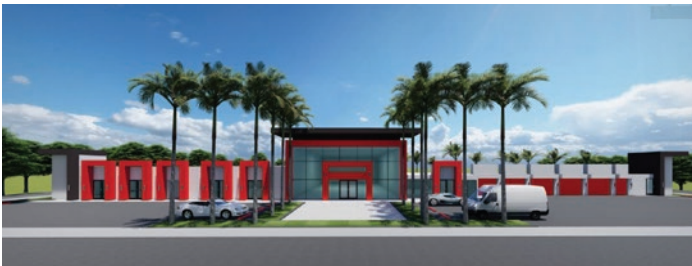
Rendering of Dales Wheels and Tires Direct, Inc. project