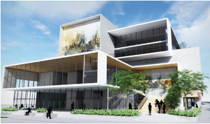
Rendering of a mixed-use commercial development project located at 909 Sistrunk Boulevard