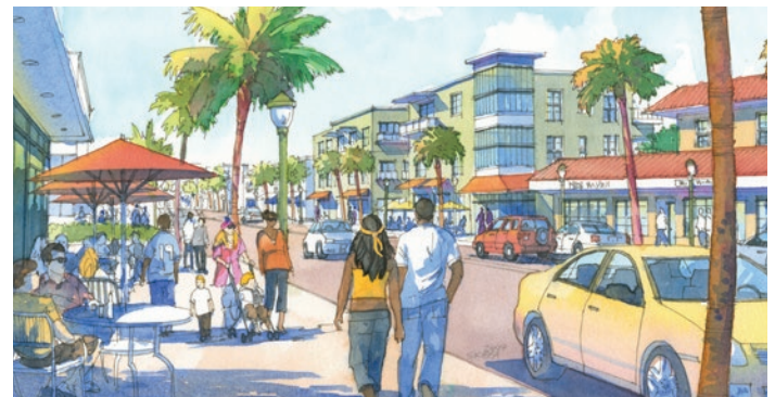
Sistrunk Boulevard Urban Design Improvement Plan Rendering