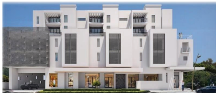
Rendering of Wright Dynasty, LLC mixed-use project