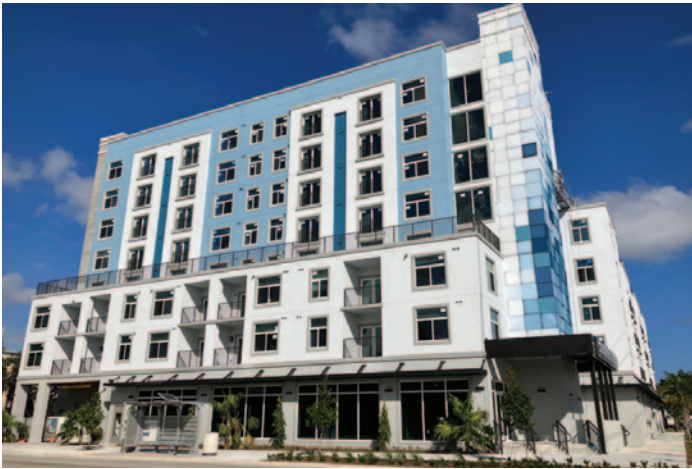
Completion of Seven on Seventh