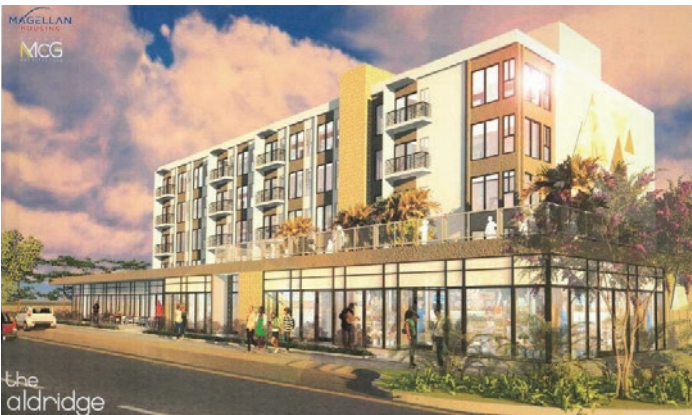
Rendering of The Aldridge project