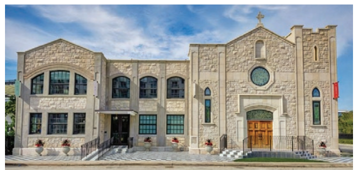
Completion of Holly Blue Restaurant and The Angeles