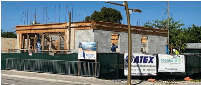
Commencement of construction of B&D Trap Restaurant