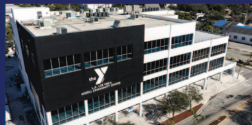
L.A. Lee YMCA/Mizell Community Center for Outstanding New Building Project

Fort Lauderdale Community Redevelopment Agency L.A. Lee YMCA/Mizell Community Center