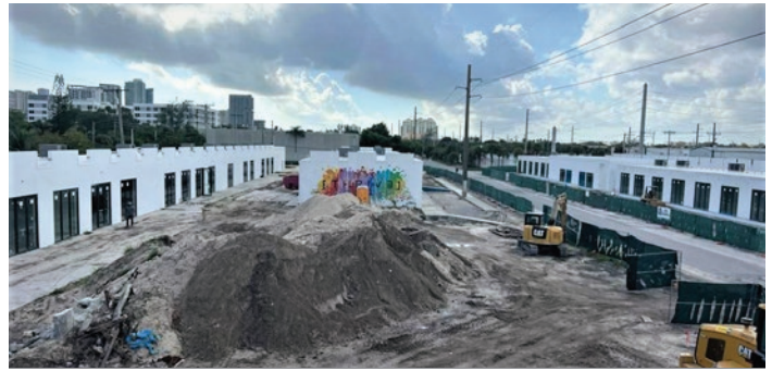
Construction of the Thrive Progresso project in FY 2022