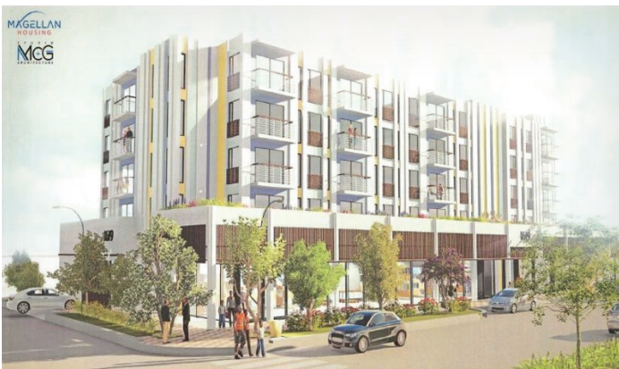
Rendering of The Laramore project

affordable housing and restricted to tenants that make at or below 60% AMI with a 30-year affordability term.