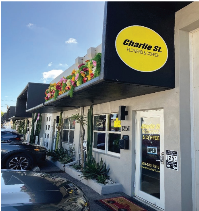
850 NE 13 Street Small Business