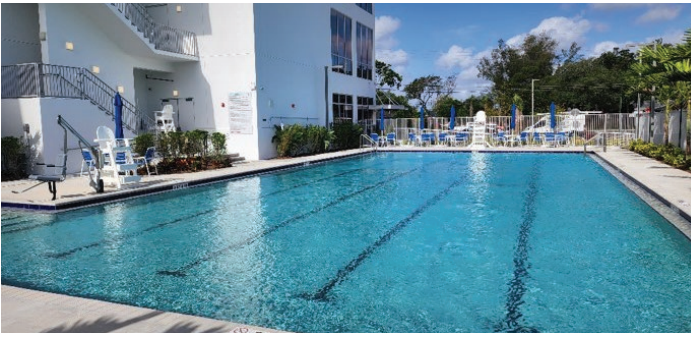
L.A. Lee YMCA/Mizell Community Center Swimming Pool