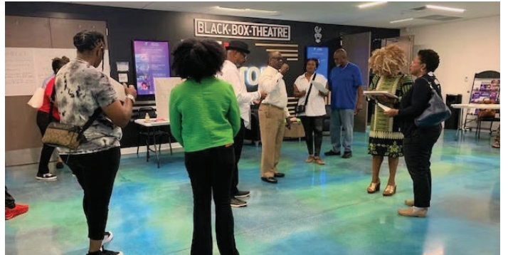
Carras Community Investment Inc. Community Forum