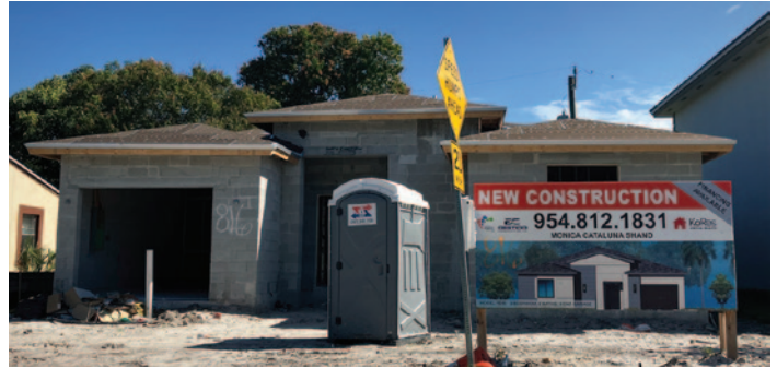
Construction of scattered site infill housing