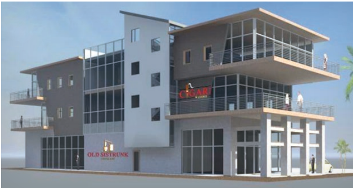
Rendering of the Victory Entertainment Complex located at 1017 Sistrunk Boulevard and 606 NW 10 Terrace