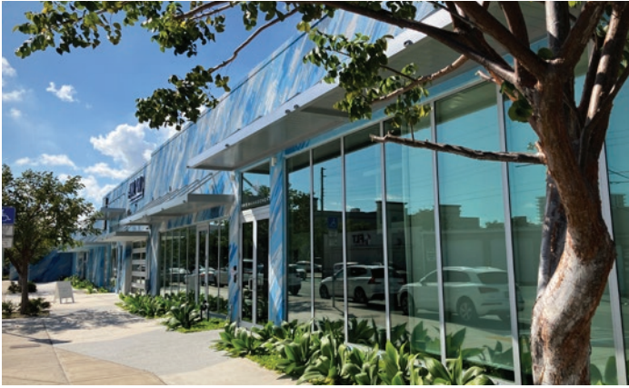
Completion of the Fabrick Project