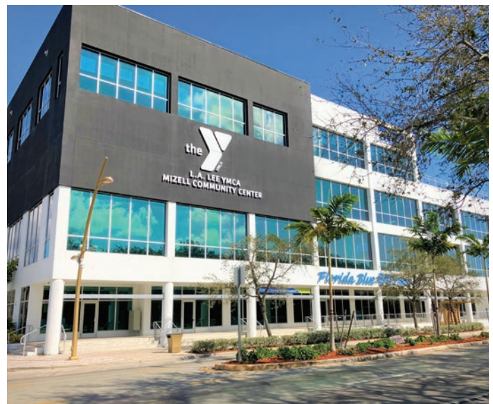
Completion of the L.A. Lee YMCA/Mizell Community Center