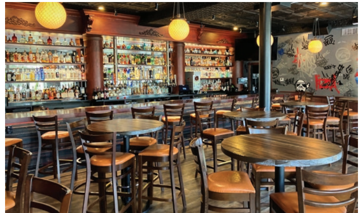
Completion of Patio Bar & Pizza