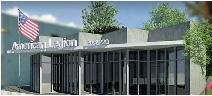
Rendering of American Legion Robert Bethal Post 220

1947, continuously providing benefits to the community through various services including ROTC scholarships, academic scholarships, little league sponsorships, targeted food giveaways, supplies for disabled veterans and fellowship among veterans. CRA funds will allow this organization to rehabilitate and expand their small 960 square foot facility to a 2,544 square foot contemporary building with a new modern kitchen, meeting rooms, handicap accessible restroom, office space and other needed improvements.