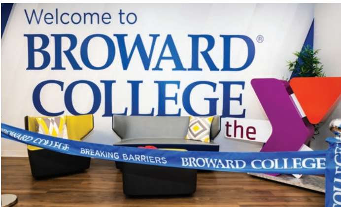
Opening of Broward College at the L.A. Lee YMCA/ Mizell Community Center