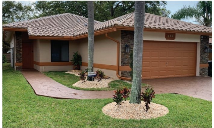
Completion of a home renovated through the CRA Residential Facade and Landscaping program