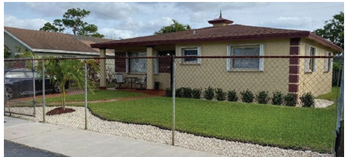
Completion of a home renovated through a pilot program with Rebuilding Together Broward County, Inc.