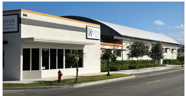
Completion of the renovation and expansion of Hoover Architectural Products offices