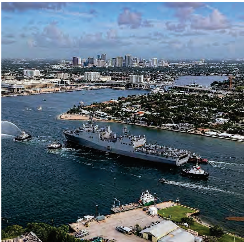
The USS Fort Lauderdale at Port Everglades, with the city's skyline in the background.

Fort Lauderdale's ship has finally come in.