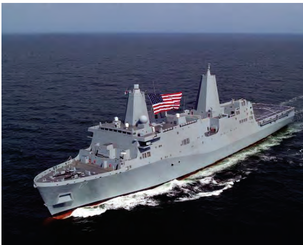
A San Antonio-class amphibious transport dock ship (LPD).