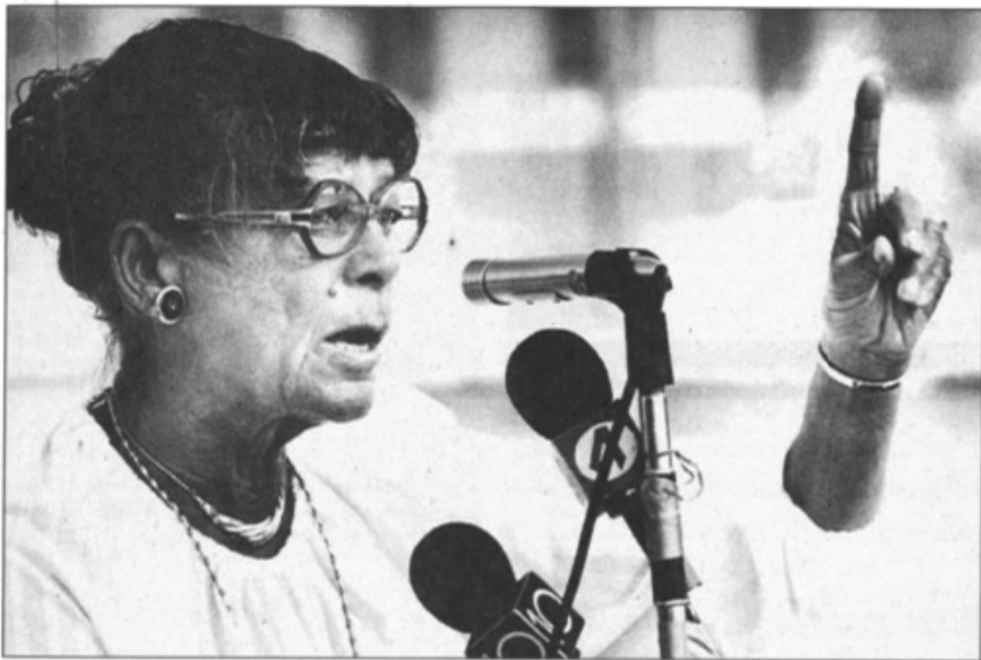
MAKING HER CASE: Civil rights pioneer Eula Johnson addresses the press during a civil rights controversy in the mid-1980s.