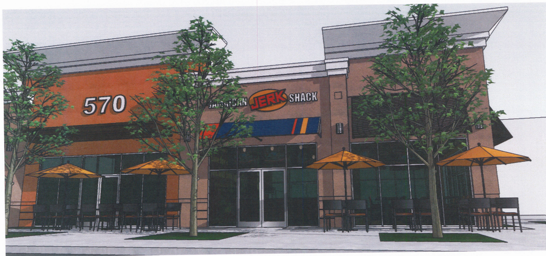
Jamaican Jerk Shack Restaurant