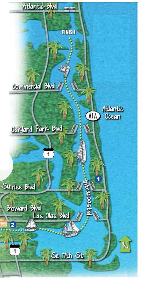
CAM # 22-0767 Exhibit 2b Page 14 of 14

DOCK CLOSURE: City of Fort Lauderdale / New River DOCKS are available to Parade participants as early as 8 a.m. Parade Day