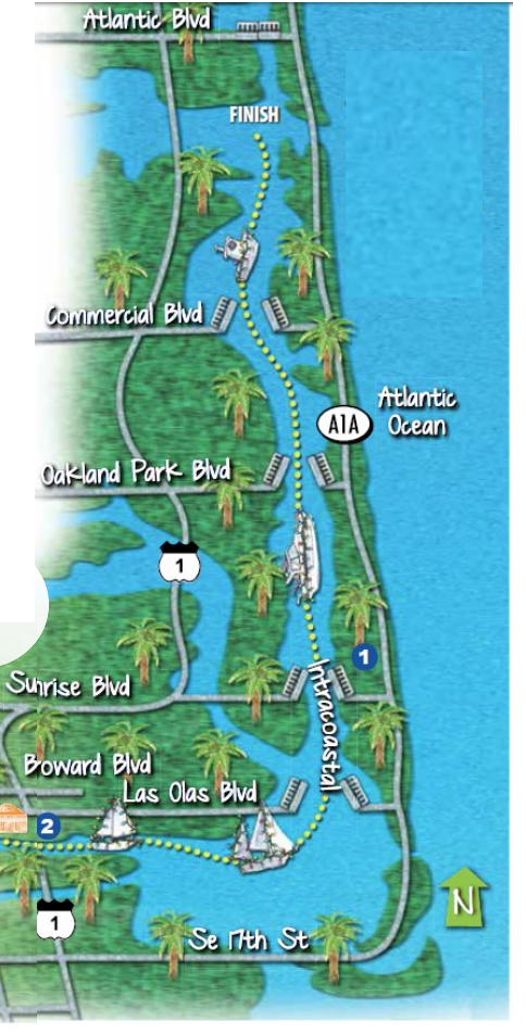
CAM # 22-0767 Exhibit 4a Page 2 of 2

DOCK CLOSURE: City of Fort Lauderdale / New River DOCKS are available to Parade participants as early as 8 a.m. Parade Day