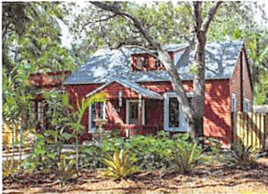
The Parrot House - 1914 701 S.W. 12th Ave.