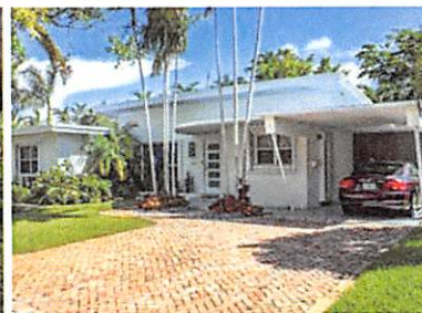
Sans Souci South - 1953 730 N. Victoria Park Rd.