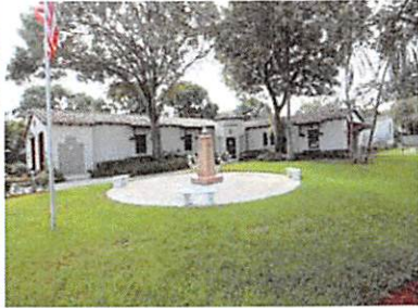
Fire & Safety Museum - 1927 1022 W. Las Olas Blvd.