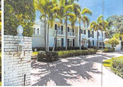
Parrot Hall - 1939 525 Coral Way

Join us for the second annual Historic Holiday Home Tour! Festivities will kick off with a reception on Saturday, December 2 from 6-8 p.m. at the Fort Lauderdale Fire & Safety Museum, located at 1022 W. Las Olas Boulevard.