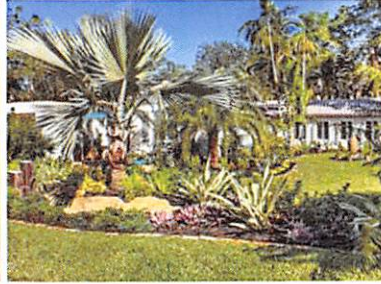
Casa de Colee - 1938 1615 S.E. 4th St.