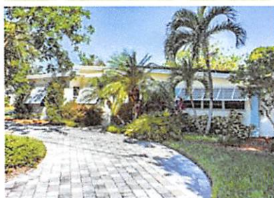
Stevens/Rogow Home - 1949-51 1001 N.E. 34th Ct.

Proceeds benefit the Broward Trust for Historic Preservation and the Fort Lauderdale Fire & Safety Museum.