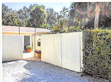
S.W. Tranquil Gardens - 1955 720 S.W. 14th Terr.