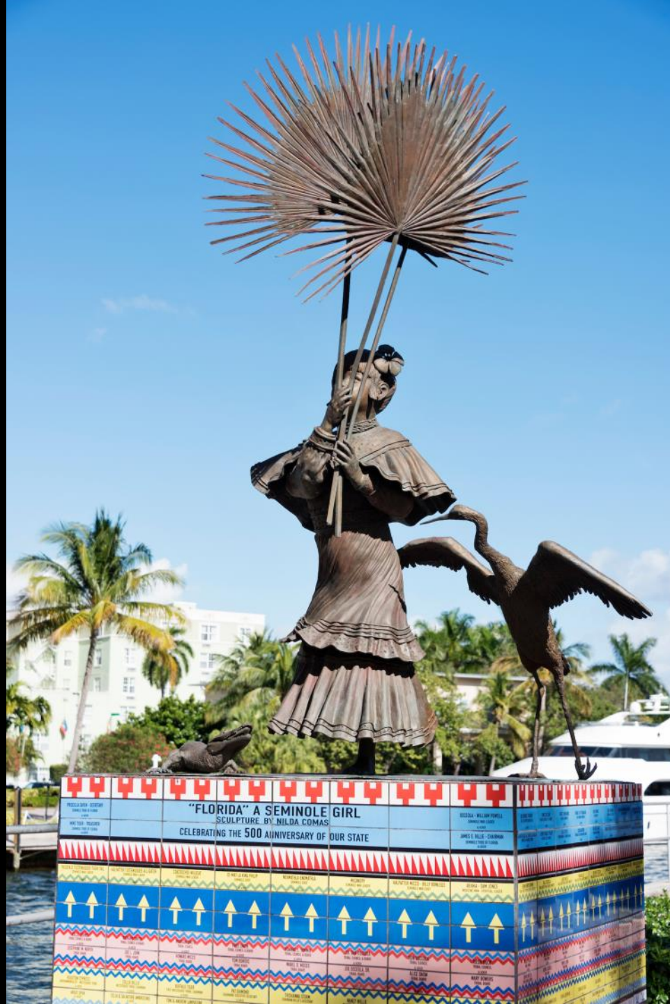
"FLORIDA" A SEMINOLE GIRL SCULPTURE BY NILDA COMAS CELEBRATING THE 500 ANNIVERSARY OF OUR STATE

WILLIAM - KIDNEY WILLIAM - KIDNEY WILLIAM - KIDNEY WILLIAM - KIDNEY