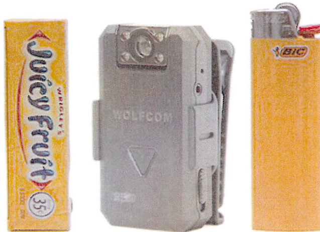
1.5 in. wide x 2.9 in. height x 0.6 in. thick

What makes the Wolfcom Vision™ so uniquely special is that it is designed to exceed the needs and requirements of just about every single law enforcement agency that is looking for the world's leading technology at a price affordable to everyone.