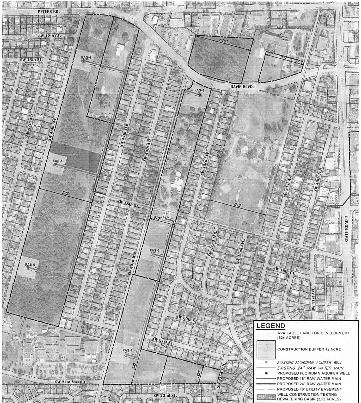
EXHIBIT B - MAP