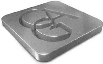
EXHIBIT "B" HOURLY BILLING RATES

Calvin, Giordano & Associates, Inc. EXCEPTIONAL SOLUTIONS™